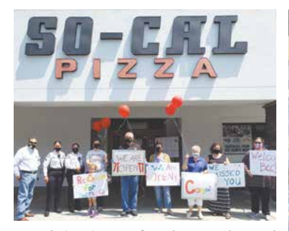
So-Cal Pizza is open for takeout orders and they are hosting a Friday Night Tailgate Party every week. Bring your canopies, tables and chairs and enjoy music while social distancing. So-Cal is located at 12253 Imperial Hwy.