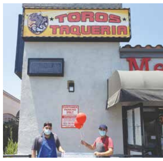
Toros Taqueria is open for takeout orders. They are located at 15617 Studebaker Rd. #2, close to the 605 Freeway!