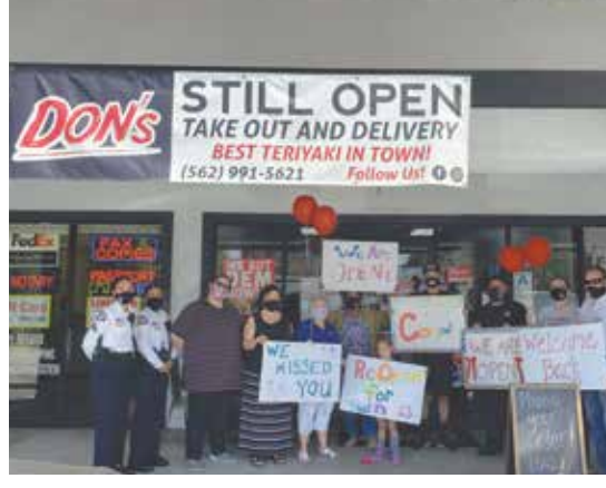
Don's Teriyaki Grill is open for both dining outdoors and takeout orders. They are located at 12327 Imperial Hwy, in the Civic Center Plaza.