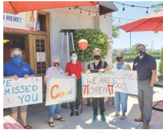
Frantone's Spaghetti Villa is open for takeout and outdoor dining. Visit them at 10808 Alondra Blvd. for a great outdoor dining experience.