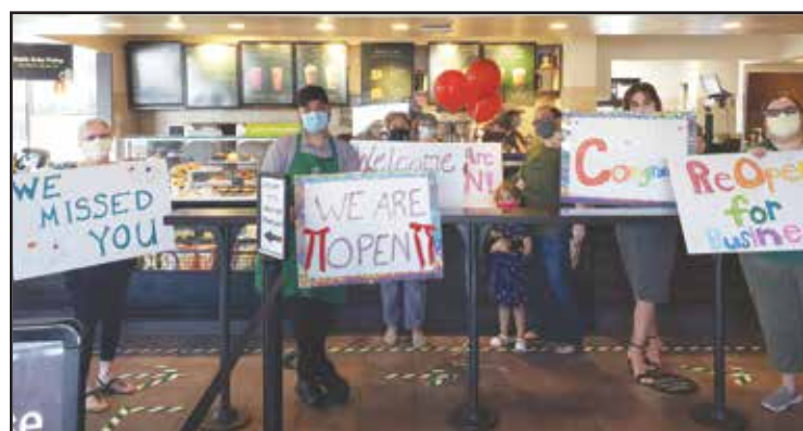
Starbucks are open for drive through, mobile pick ups and order in store for your coffee needs. They are not ready yet for indoor seating. You can visit them at 11790 Firestone Blvd, at the corner of Firestone and Pioneer.