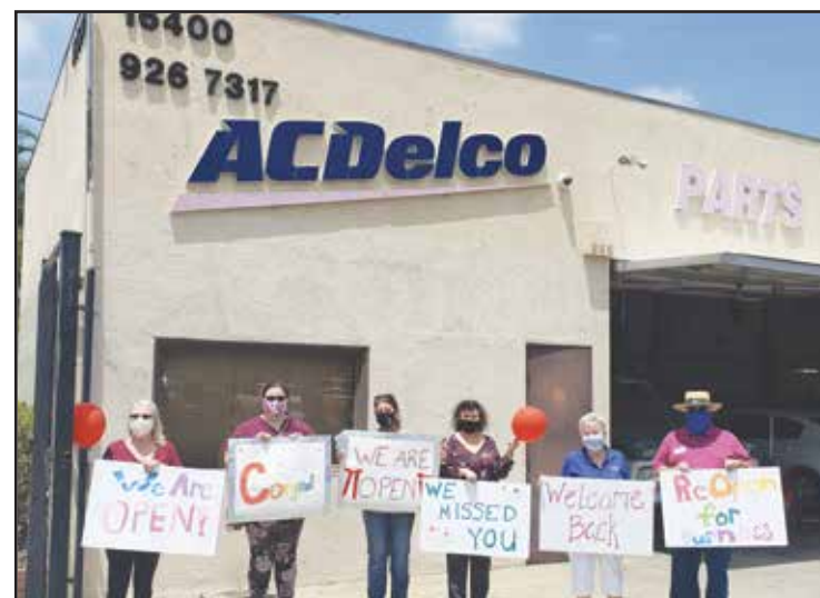
Okimoto's Automotive Center is here and open for business. If you need car service they are located at 16400 Pioneer Blvd in Norwalk.