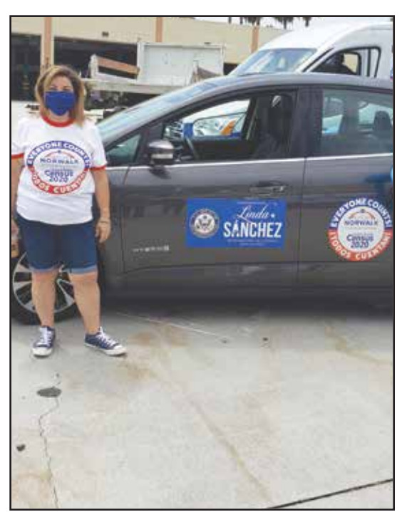
Congresswoman Linda Sanchez participates in Norwalk's Census Parade.