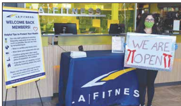
LA Fitness has reopened their facilities located at the Norwalk Fitness Village. Address is 12211 S. Norwalk Blvd. in Norwalk. Visit their website to learn about the requirements for visiting in person at www.lafitness.com .