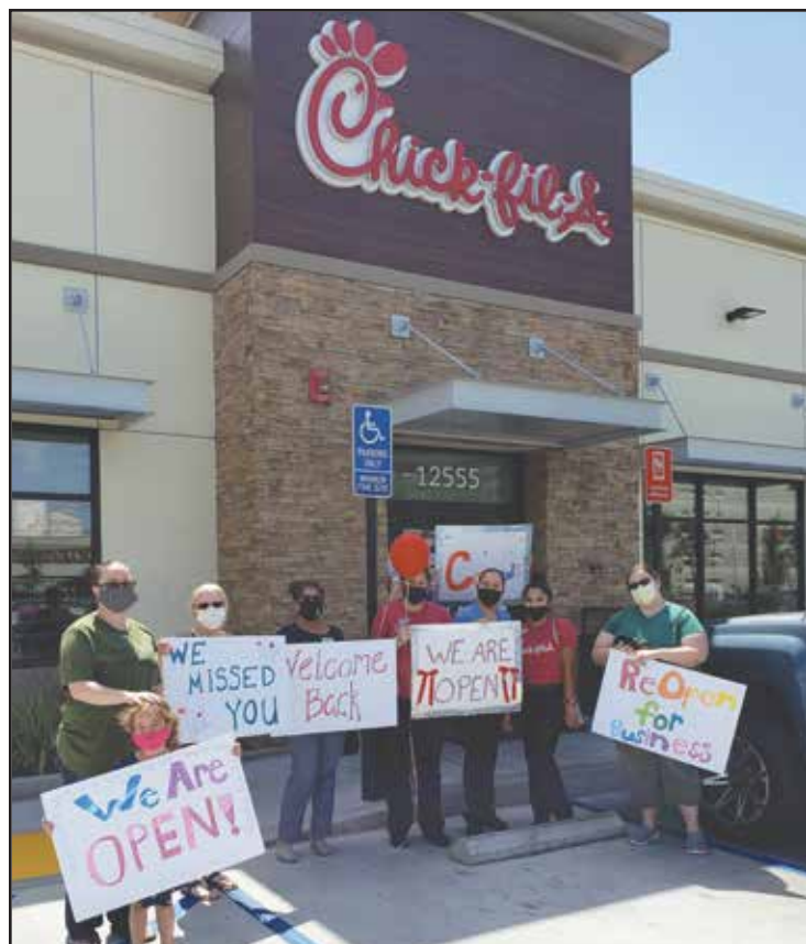
Chick-fil-A is now open for indoor seating and continues with drive through and delivery services.