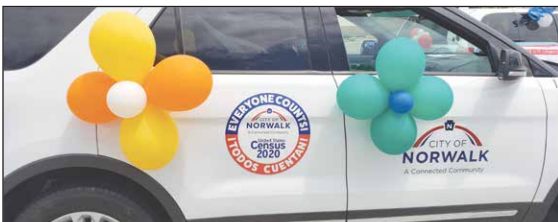
Norwalk City Staff getting ready to head out for the Census Parade.