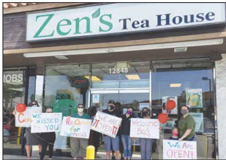
Zen's Tea House is now open for indoor seating and continuing their to go orders. You can also find Zen's Tea House at the Norwalk Farmer's Market and online. Address is 12848 Pioneer Blvd. Norwalk.