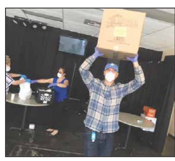
facilities to provide donation food and goods.