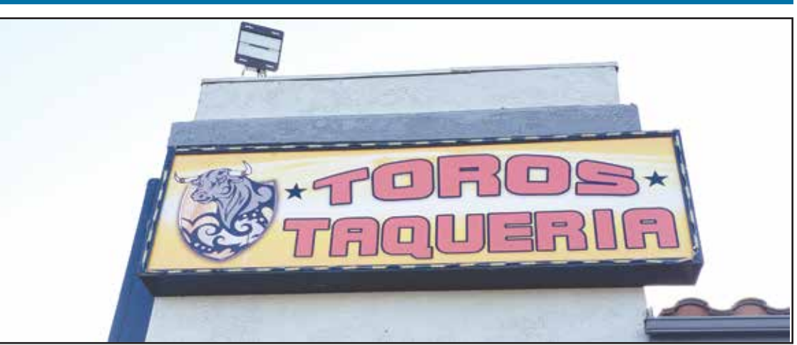
Toros Taqueria has been open for takeout service, but looks forward to being able to offer indoor seating as we move through Stage 2 of the recovery process. They are located at 15617 Studebaker Rd. #2 in Norwalk.

PRESORTED STD U.S. POSTAGE PAID SANTA FE SPRINGS, CA PERMIT NO. 1000