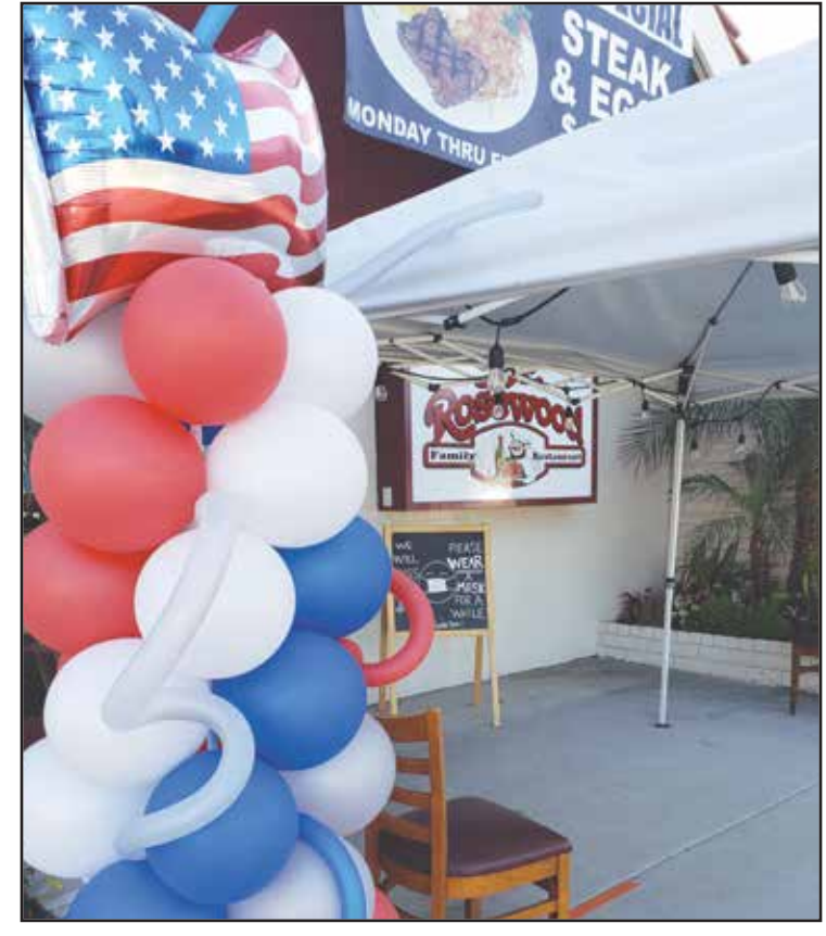
Mr. Rosewood Family Restaurant, open for takeout and delivery orders has been preparing for the day that they can safely reopen! They are located at 10640 Rosecrans Ave. in Norwalk.

done with the health of the consumer and the community being the most important reason. businesses as reopen, there is still no vaccine available COVID-19, so there are still opportunities for community spread. we move into our new normal, visit CDC.gov to find out information on the safety measures you should take for you and your family to have the best health you can. Pay attention to the signs that will be posted at your favorite restaurant to let you know about their restrictions and let us all support each other as we move through this reopening process together!