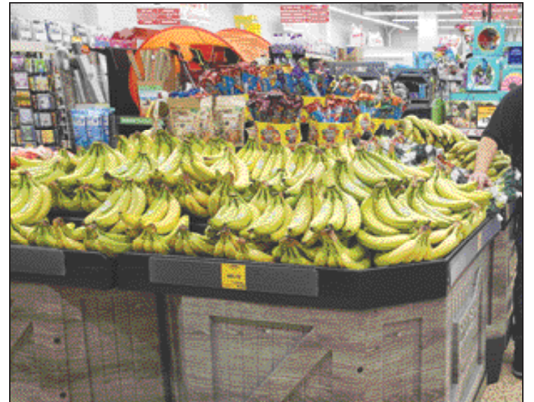
Grocery Outlet is also stocked up on fresh product! Every day new items are delivered to the store, so visit to see what you can purchase for your stay at home order!