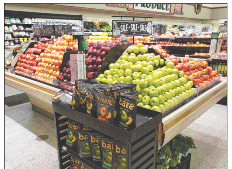
Stater Bros produce section showing a wide variety of fresh fruits.

These members provide essential services and allowed to stay open during this time.