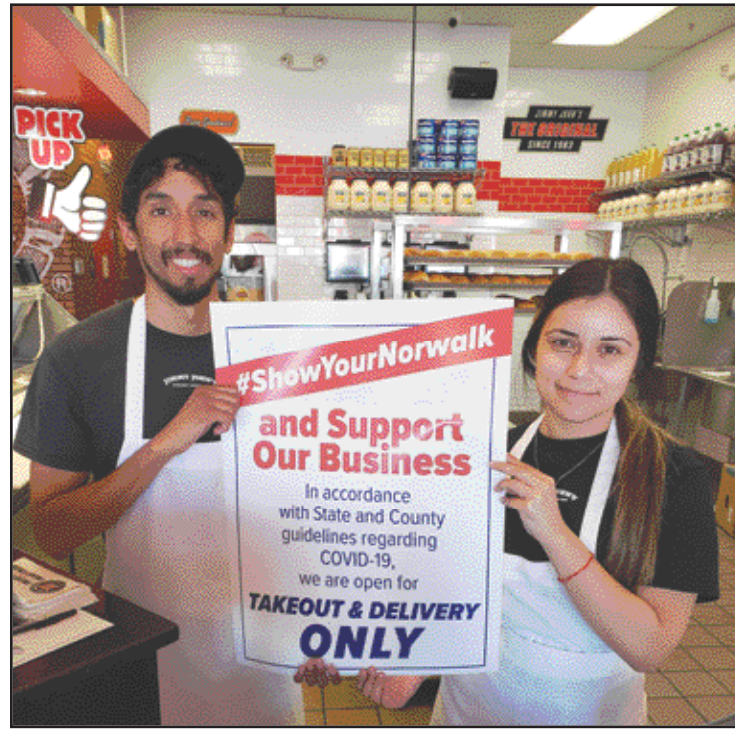
Jimmy Johns is open and providing takeout orders or delivery within a 1 1/2 mile radius from 12431 Norwalk Blvd. Suite D, in Paddison Square.