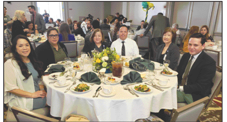
Staff of Coast Plaza Hospital at the State of the City Luncheon.