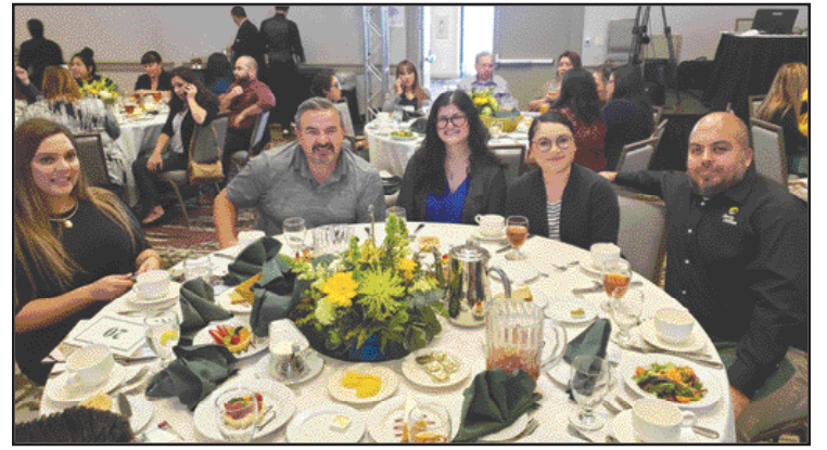
Liberty Utilities is attending the State of the City Luncheon.