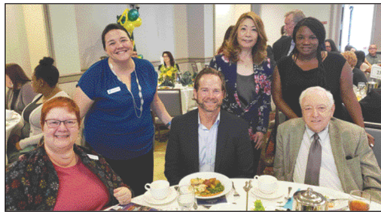
Greater Whittier YMCA is at the Norwalk State of the City Luncheon.