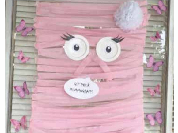
Norwalk Community Development Department decorates to support getting your mammograms!