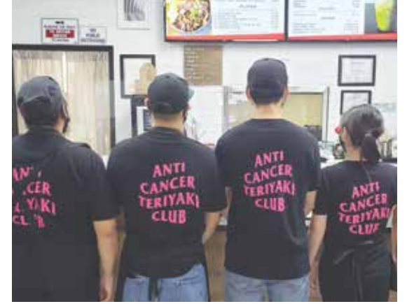
Don's Teriyaki Grill giving a PTPP T-Shirt to those who donated $25.00 or more.