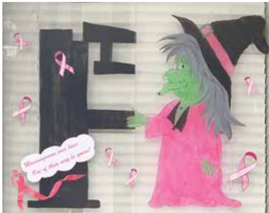
City of Norwalk once again decorated the different departments to support the fight against breast cancer. This window was decorated by Norwalk City Clerk's office.