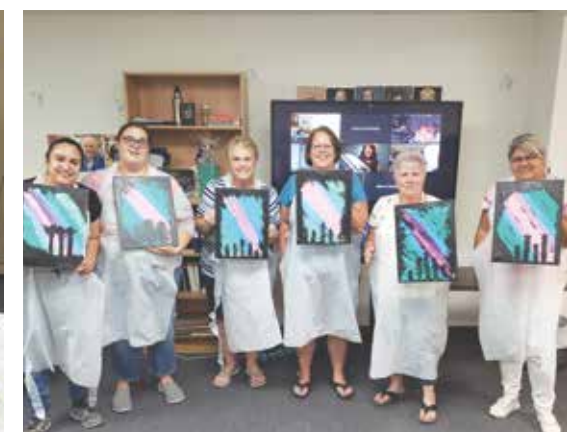
Our group of painters show off their finished product!