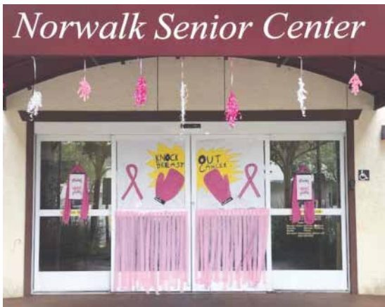
Norwalk Senior Center supporting the "Paint the Town Pink" campaign.