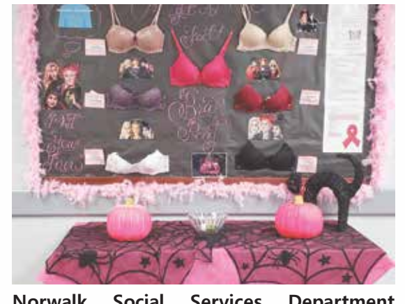
Norwalk Social Services Department supports breast cancer awareness month with a visual display.