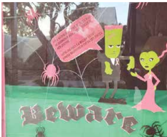
City of Norwalk Administration Department gets onboard with a well decorated window for "Paint the Town Pink" Norwalk.