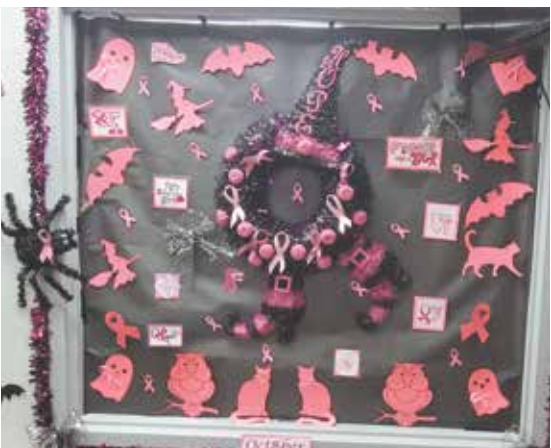
A spooky display at the Social Services Department to support breast cancer awareness month.