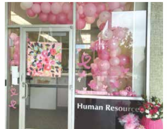
Norwalk Human Resources is all decked out in pink for breast cancer awareness.