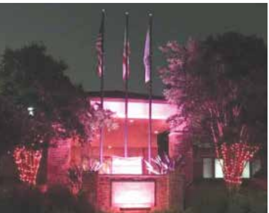
City of Norwalk lights up pink at night throughout the City properties.