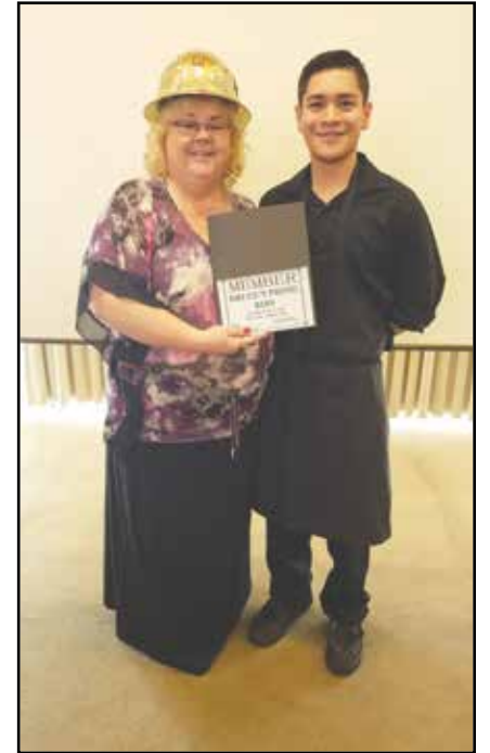
Bruce's Prime Ribs is recognized with their 38 year membership renewal plaque.