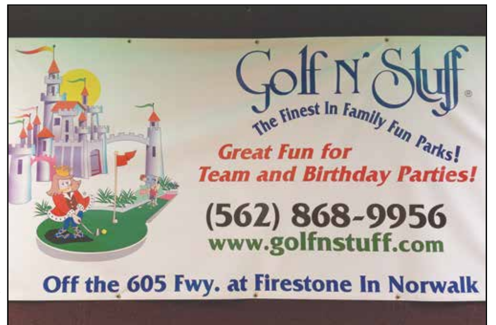
Golf n' Stuff is the host of our April Creating Connections Lunch

For nearly 40 years, Golf N' Stuff has been providing quality family entertainment for all ages. The park features unique miniature golf courses, go-karts, and bumper boats. They also have the most current and up to date video and prize arcade games available for your enjoyment. They have something for everyone. If you are planning a group outing, birthday party, company event, church celebration, sports banquet, or just a special get together, look no further. Golf N' Stuff can make any event memorable. For information about GOLF N' STUFF and our services, please give us a call or drop us a note. One of our friendly staff members will be happy to assist you. We look forward to seeing you!