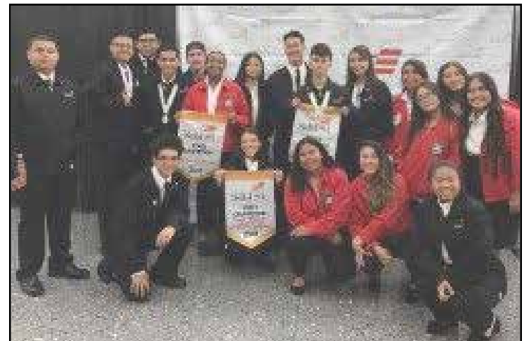
In total, Norwalk High School had 19 students participate in the 2018 SkillsUSA CA. Leadership and Skills Conference. Their hard work resulted in NHS earning the Lowe's-SkillsUSA Models of Excellence Award, 5 gold medals, and 2 silver medals. These Lancers represent the future of Norwalk, and will be: "Job Ready- Day One!"