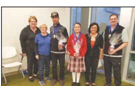
The putting competition winners are pictured here receiving their awards.