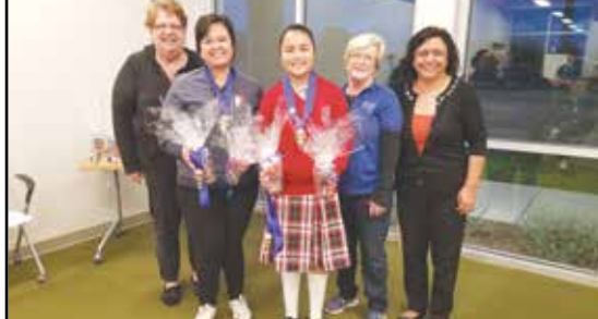
The Team from St. Linus Church received the 3rd place trophies.