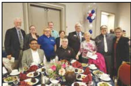
Norwalk Chamber members and guests attending the Annual State of the city Address.