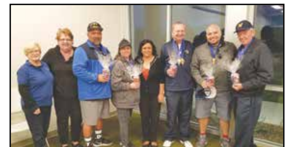
Team Gordonator receiving their Golden Golf Ball trophies, after 5-peating at the Annual 9-Hole Golf Classic.