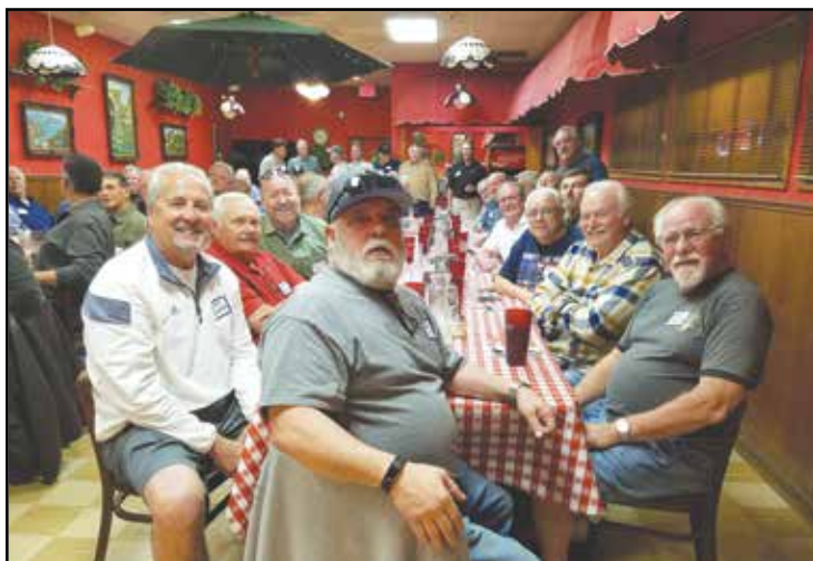
Some of the many who attend the Excelsior bi annual reunion luncheon