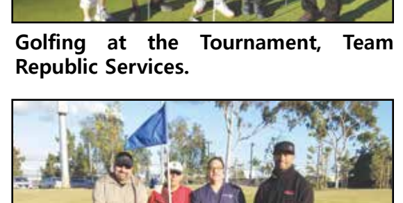
Pictured here is the golf team from C R & R Environmental Services, Inc.