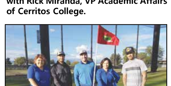
Golfing at the Tournament, Team Republic Services.

Norwalk Chamber of Commerce 14783 Carmenita Road, Norwalk, CA 90650