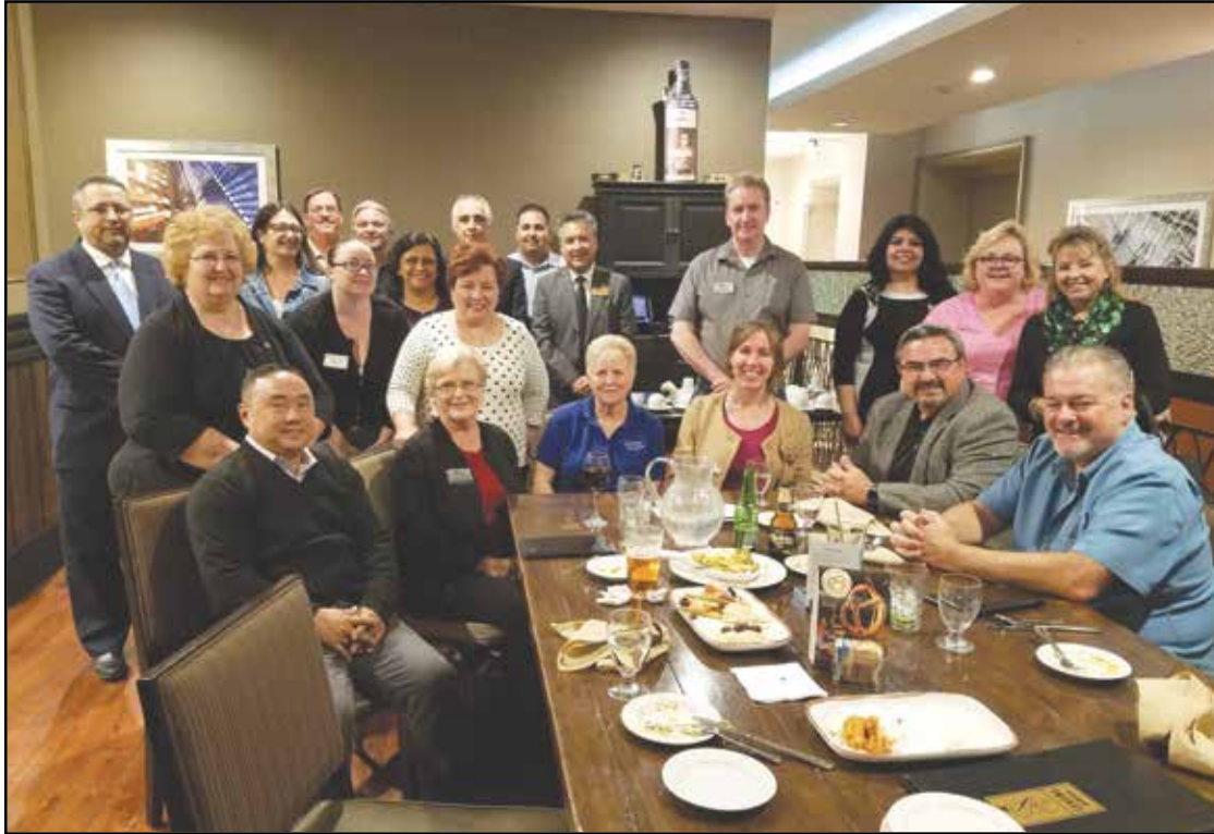
Guest enjoyed the food and ambiance of the newly renovated Doubletree Hotel in Norwalk. Pictured here are some of our attendees.