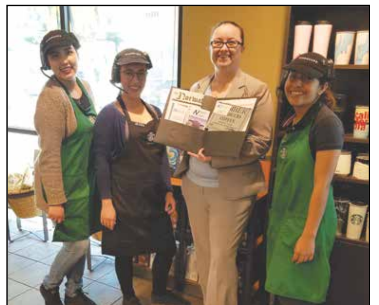
Starbucks Coffee located at Rosecrans and Shoemaker receives their 3 year renewal plaque.