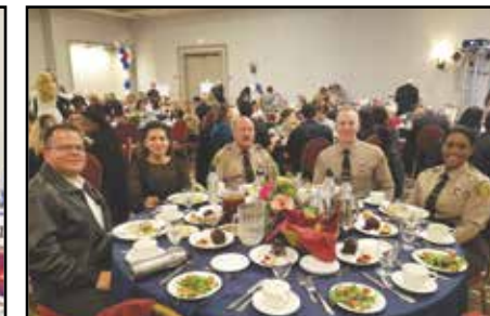
Los Angeles County Sheriffs are enjoying the lunch at the Annual State of the City Address.