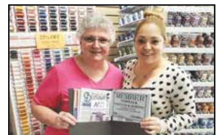
Staff at Norwalk Vacuum & Sewing receives their 31 year membership renewal plaque.