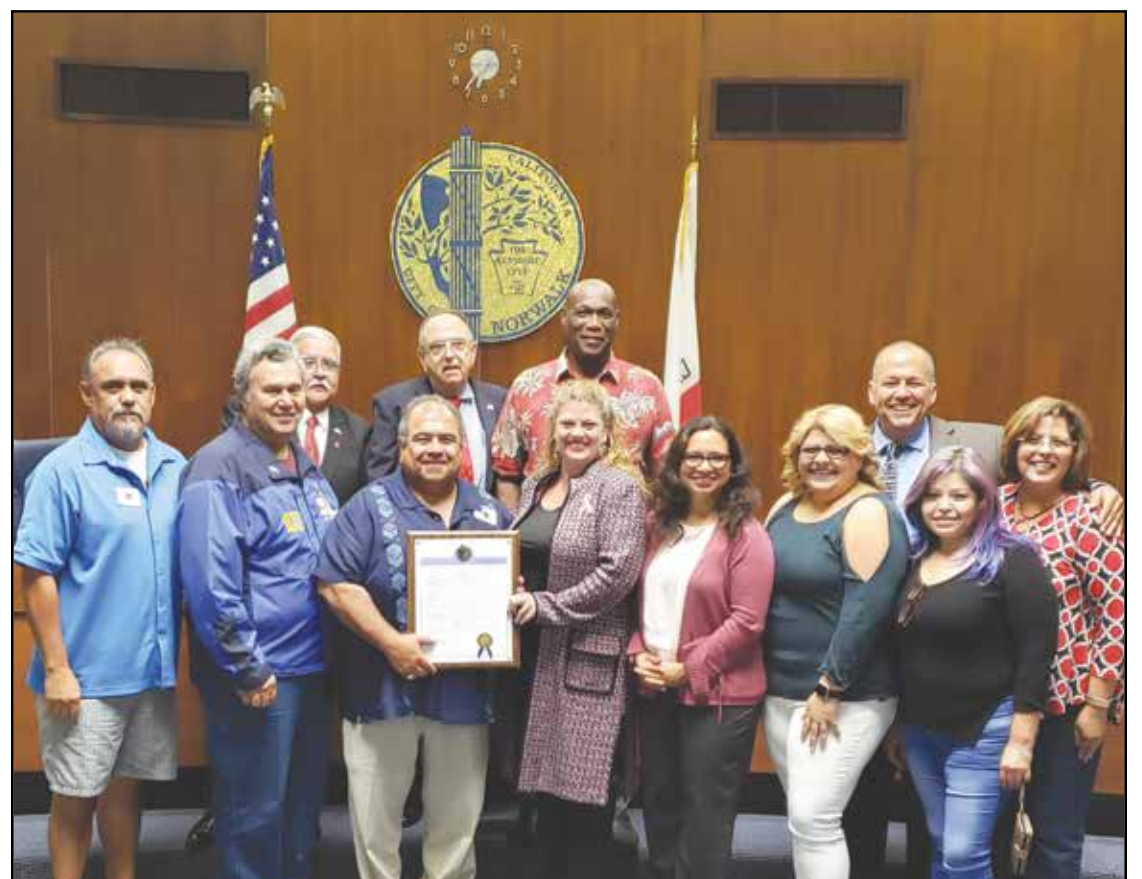
Norwalk Lions Club receives recognition from Norwalk City Council naming October 13th, 2018 as Lions Club White Cane Day.

City of Norwalk recognized the Norwalk Lions Club for their White Cane Day, which is celebrated by Lions Clubs around the world in October of each year. White Cane Safety Day is an opportunity to increase awareness about the white cane, which signifies that a pedestrian using it is blind or visually impaired; it alerts motorists of the need to exercise special caution and provides the user the right of way. It also symbolizes the independence, confidence and skills of the person who is using it.