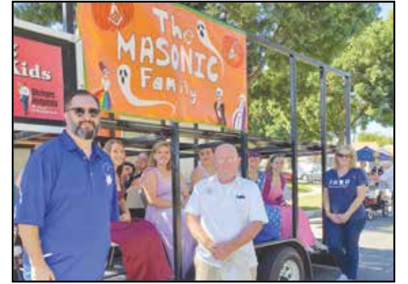
Golden Trowel Norwalk Masonic Lodge #273 getting ready for the Halloween Parade to start.