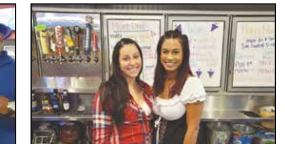
Staff at So Cal Pizza getting ready for the Fall Festival.