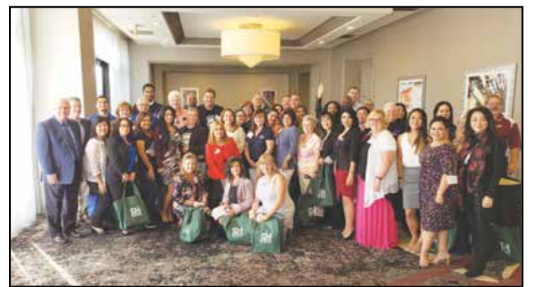
Attendees gather at the 2018 Southern California Ambassador Rally.