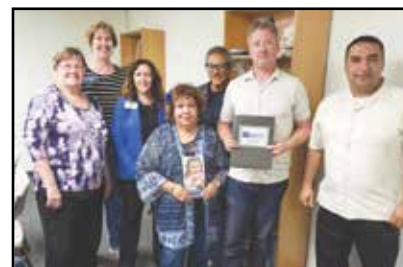
Our new Norwalk Kiwanis Club receives their membership plaque.