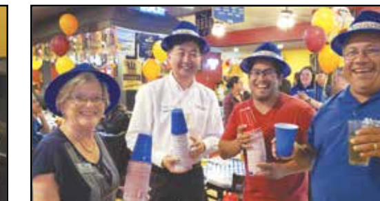
Competing in the cups game at the Annual Fall Festival.