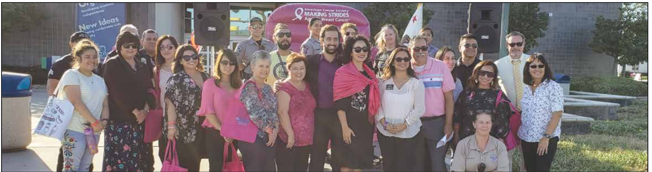
Getting ready to walk at the Cerritos College Strides Walk are students, staff, faculty, residents and City of Norwalk.