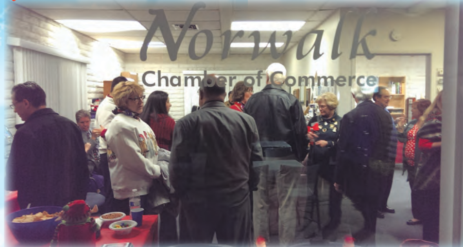
The Norwalk Chamber office is filled with members and guests celebrating the holidays and networking.