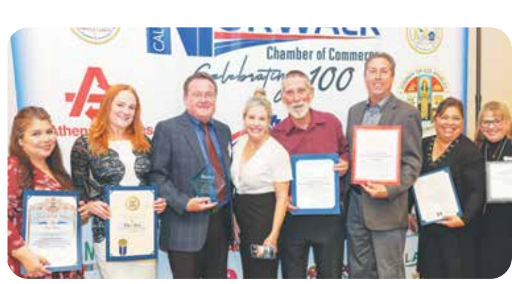
The Team at Norwalk La Mirada Plumbing, Heating and Air Conditioning is recognized as a Norwalk Chamber member for 60 years.