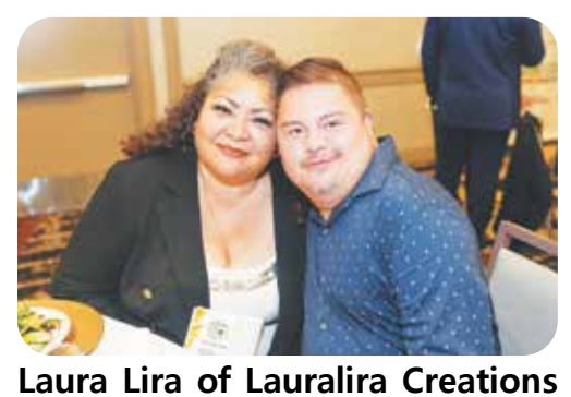
Decorations with and son Edwin celebrate with the Norwalk Chamber at the Gala.