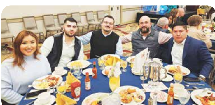
Northgate Gonzelez Market Team at the Mayor's Prayer Breakfast.