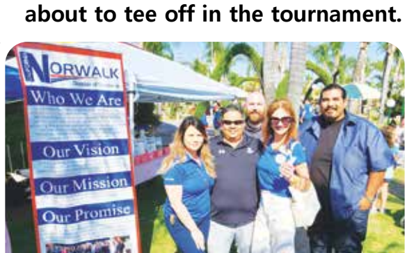
Norwalk Doubletree Hotel waiting for the tournament to start.