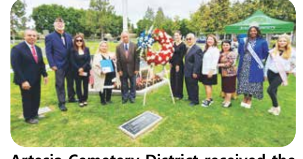
Artesia Cemetery District received the new member plague for the Norwalk Chamber of Commerce.