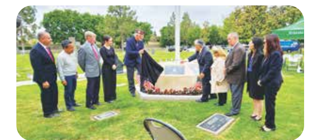
Unveiling the new plaque for the Space Force.