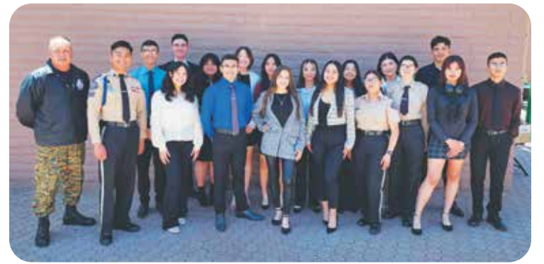
Students from Southeast Academy after they have completed their Mock Interviews.