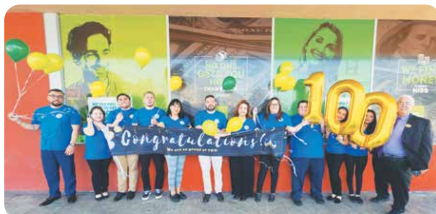
Alba Professional Services/H & R Block congratulate the Norwalk Chamber on their 100th Anniversary.

Connect with the Norwalk Chamber over "Coffee + Conversation" Join us for a networking event at Chick-fil-A in Norwalk.