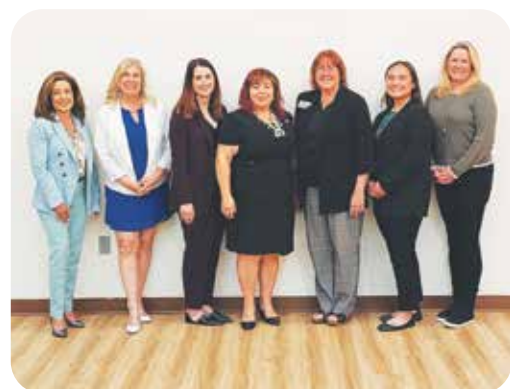
Congresswoman Linda Sánchez hosts a roundtable for local Chamber of Commerce leaders.