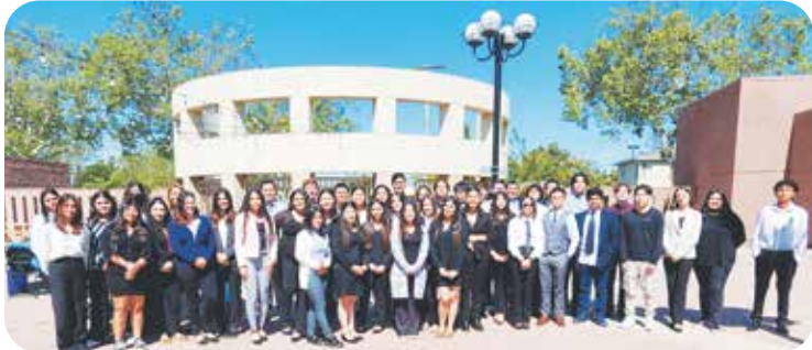
Norwalk High School students attend and participate in the Norwalk Education Alliance (NEA) Annual Mock Interviews.