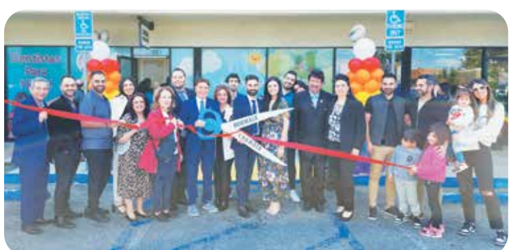
A second Ribbon Cutting was held as additional family and friends of Ladybug Kids Dental arrived to help with the celebration.