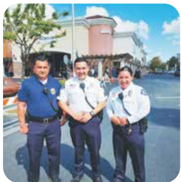
Norwalk Public Safety Officers were on hand to help with the Ribbon Cutting at Something Good LA.