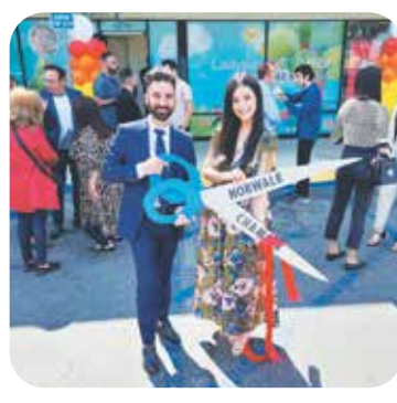
After the ribbon is cut, Ladybug Kids Dental welcomes in the Norwalk Community.