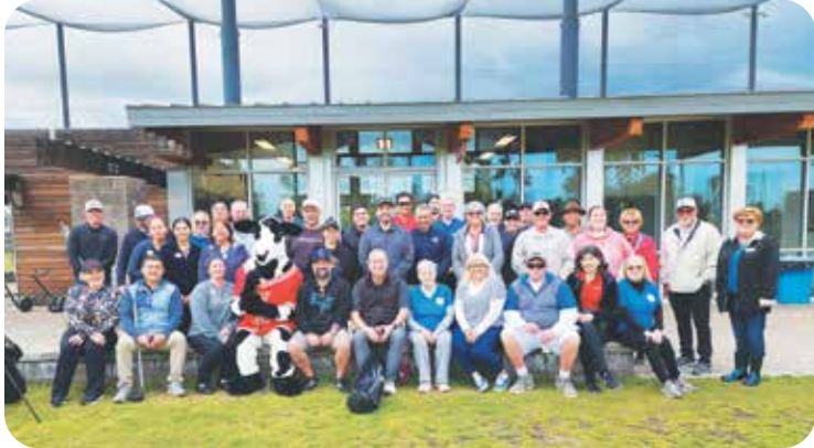
Norwalk Chamber Golf Tournament, getting ready to tee off.