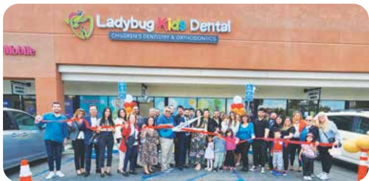
At the Ribbon Cutting for Ladybug Kids Dental were family, friends, Norwalk Chamber representatives and community members.

Check out Ladybug Kids Dental and bring your kidlets here for their dental services. You can visit their website at www.ladybugkidsdental.com for additional information or to make an appointment.