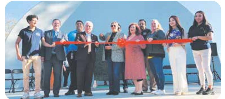
Getting ready to cut the ribbon for the new Public Wifi at Hermosillo Park.