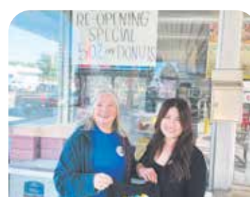
Commissioner Patti Hoskins visits Donut King on Small Business Saturday.