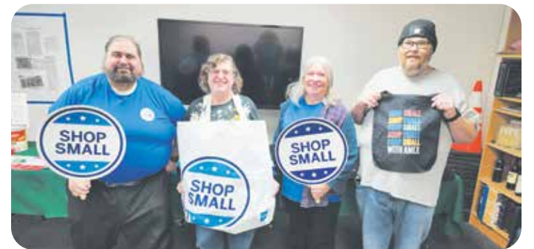
Supporting our Small Business Community on Small Business Saturday.