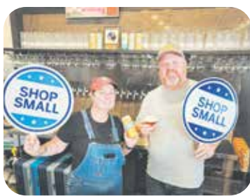
La Jara Brewing Co. is open on Small Business Saturday to serve new brews to those that visited them that day.