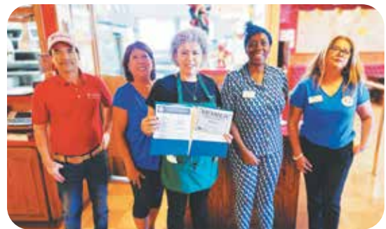
Ambassadors visit Frantone's Restaurant to deliver their membership renewal.