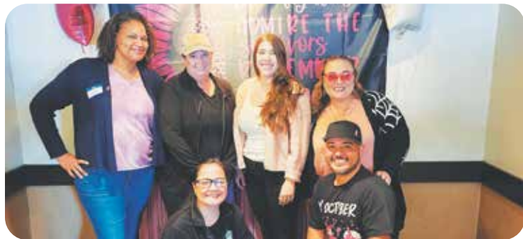
Starbucks Coffee Managers from Norwalk and surrounding cities help kick off Paint the Town Pink.