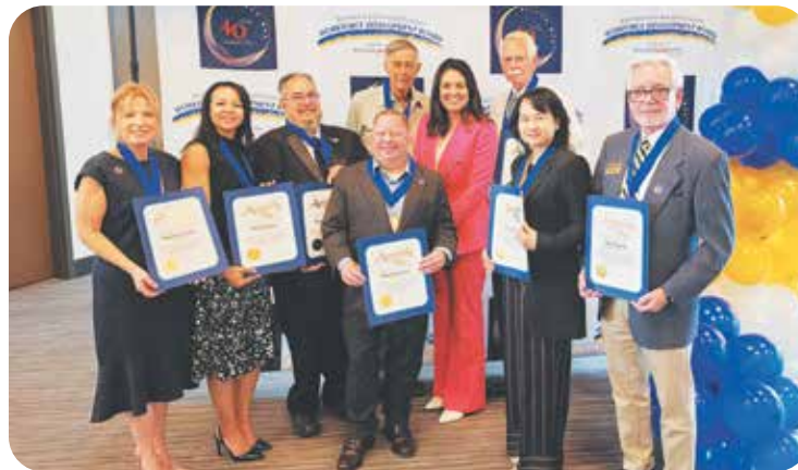
SELACO WDB Board Members are recognized for their years of service with a medallion.