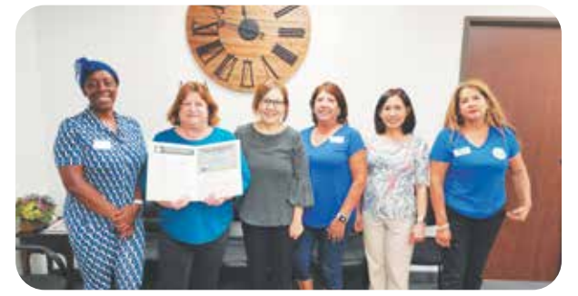
Thompson & Associates receives their membership renewal from our Chamber Ambassador Team.