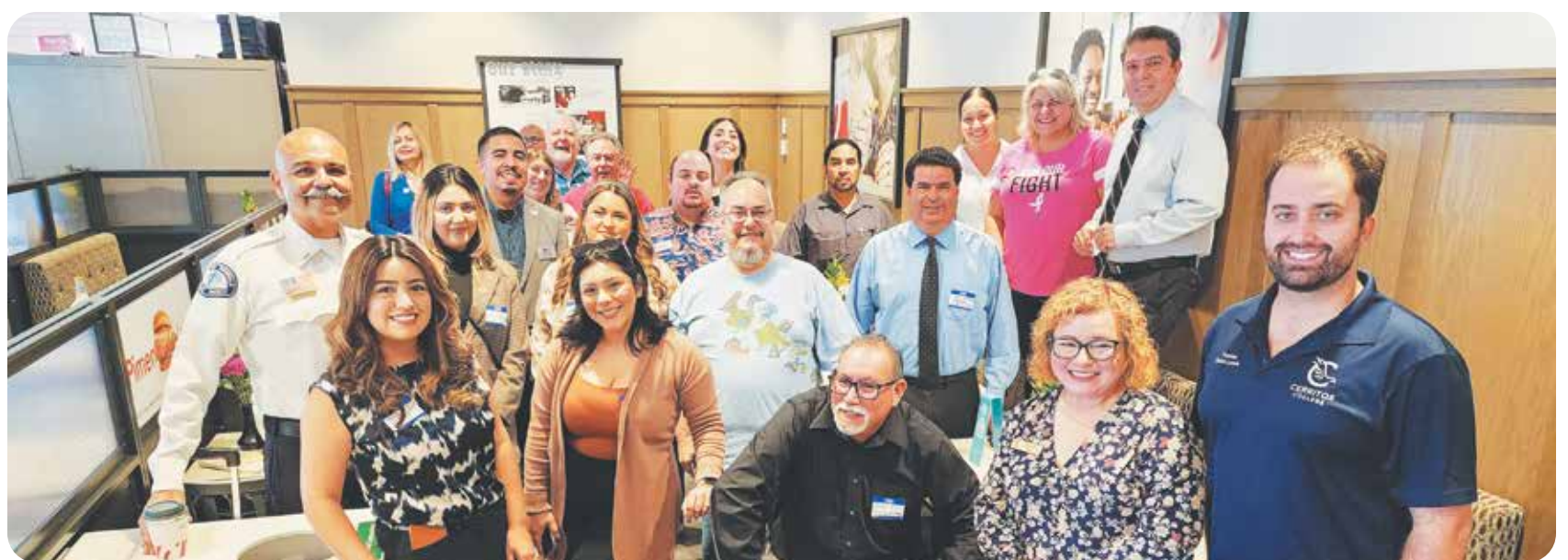
Attendees at the September Coffee and Conversation at Chick-fil-A.