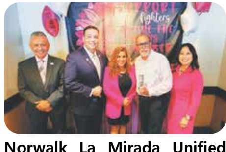
Norwalk La Mirada Unified School District Board Members and staff at Paint the Town Pink.