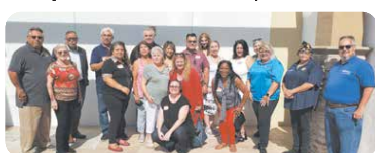
Our New Members and Chamber Board Members and Ambassadors pictured at the Meet & Greet.