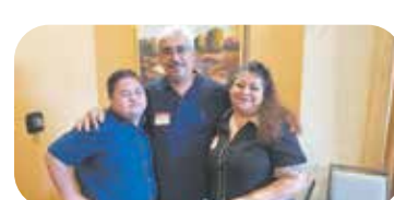
New Member Laurira Creations & Designs attends the New Member Meet & Greet.