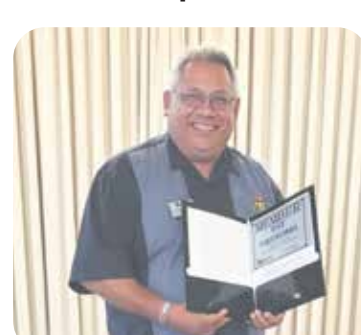
TNT Fireworks celebrated 32 years as a member of the Norwalk Chamber!