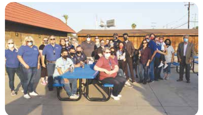
A great time was had by all who attended the golfing event!