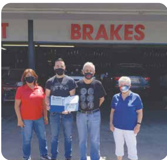
Delivering the membership renewal to Best Buy Tire Pros.