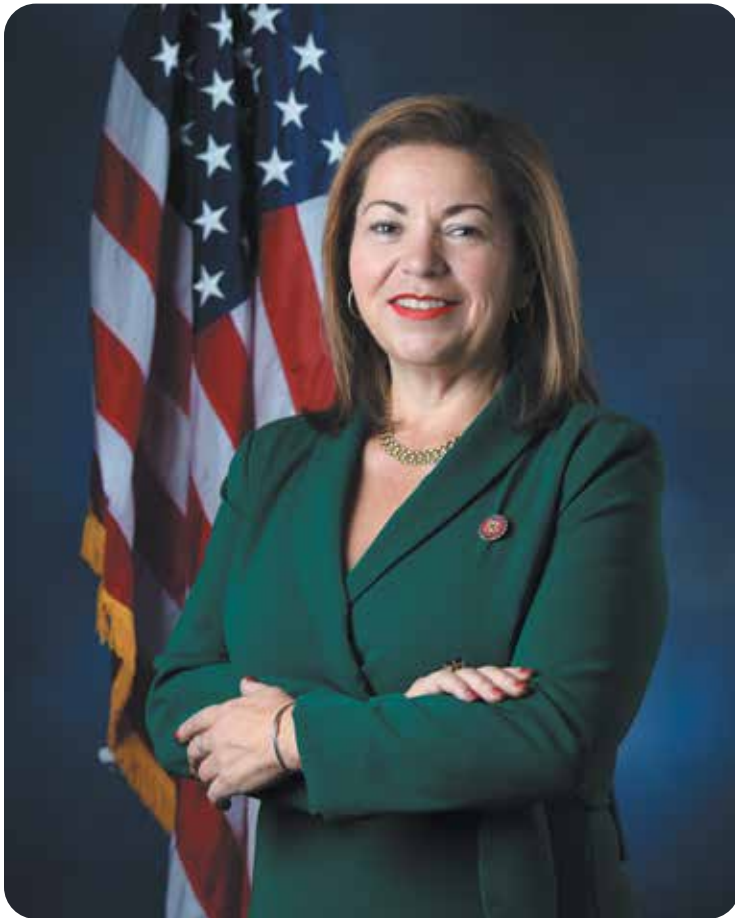
Congresswoman Linda Sanchez