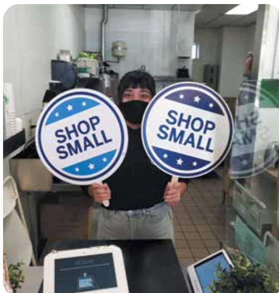
Zen's Tea House is celebrating Small Business Saturday.

March 24th 7th Annual Spring Swing 9-Hole Golf Tournament Don Knabe Golf Center