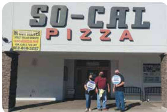
So Cal Pizza is open for business on Small Business Saturday!