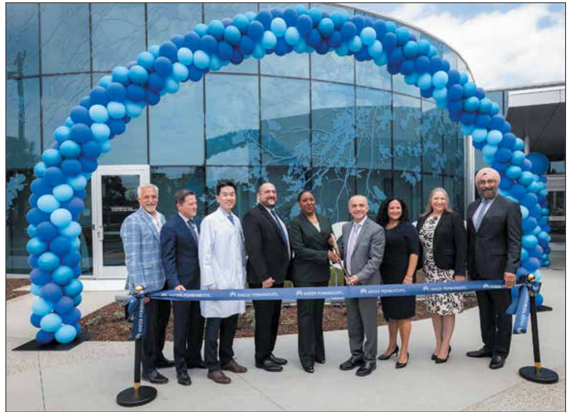
Staff and executive officials cuts the ribbon on Kaiser Permanente's new Bellflower Radiation Oncology Center on Friday, April 19.

My conclusions? While the major scientific professional organizations we rely on state that no harmful effects have been shown, we all can decide for ourselves. The only sure strategy to avoiding any potential harm is to stop using these products, choosing only natural products that are free of phthalate, paraben, triclosan, and fragrance. Personally, these issues do not unduly concern me.