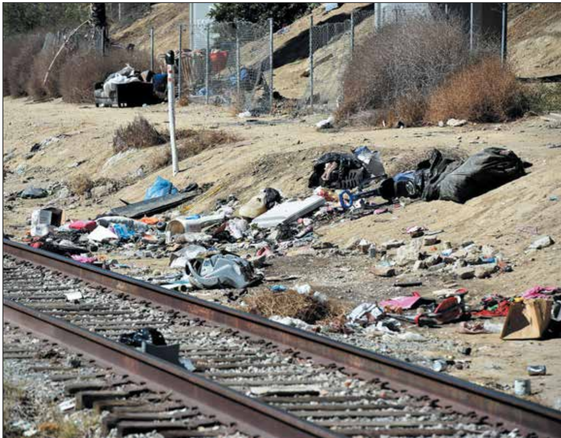
L.A. County will work to house nearly 600 people living along the 105 Freeway from Norwalk to West L.A. after receiving a $51.5 million state grant.

Pathway Home is an encampment resolution program that is a critical component of the County's comprehensive response to the local emergency on homelessness adopted by the Board of Supervisors in 2023. By leveraging emergency powers and partnerships with local jurisdictions, Pathway Home is a full-circle solution that brings people off the streets into immediately available