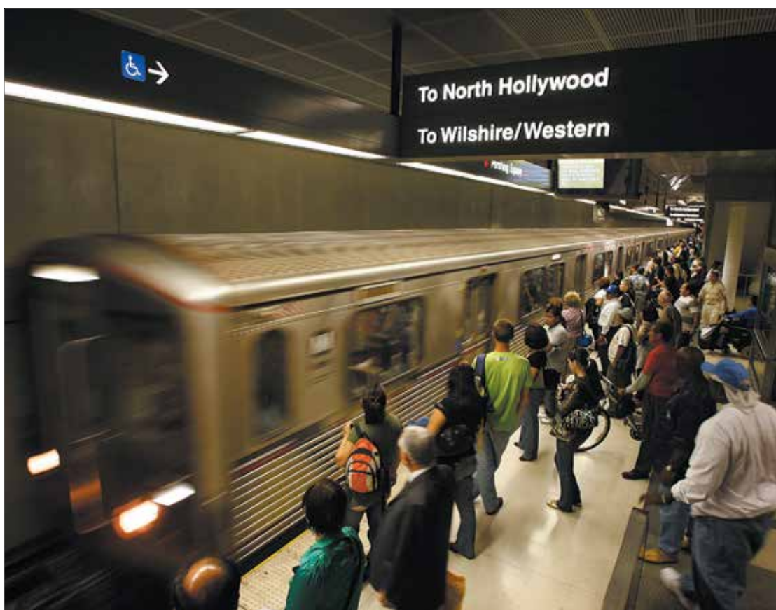
Metro reported nearly 26 million boardings on its buses and trains last month, a 9.4% increase from last year.

More than 20 million rides were taken on Metro buses, with total bus ridership in March at 85.6% of its pre-pandemic level. Metro