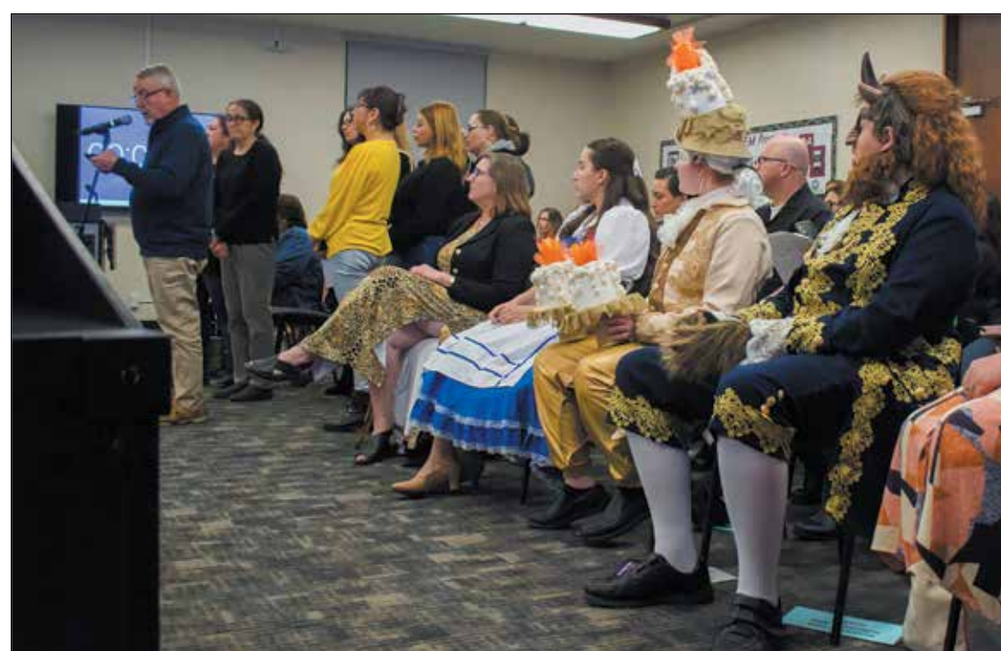
Dual - language teachers and the school district increase the supplemental dual stipend as Benton musical theatre actors watch during the board of education meeting on Monday