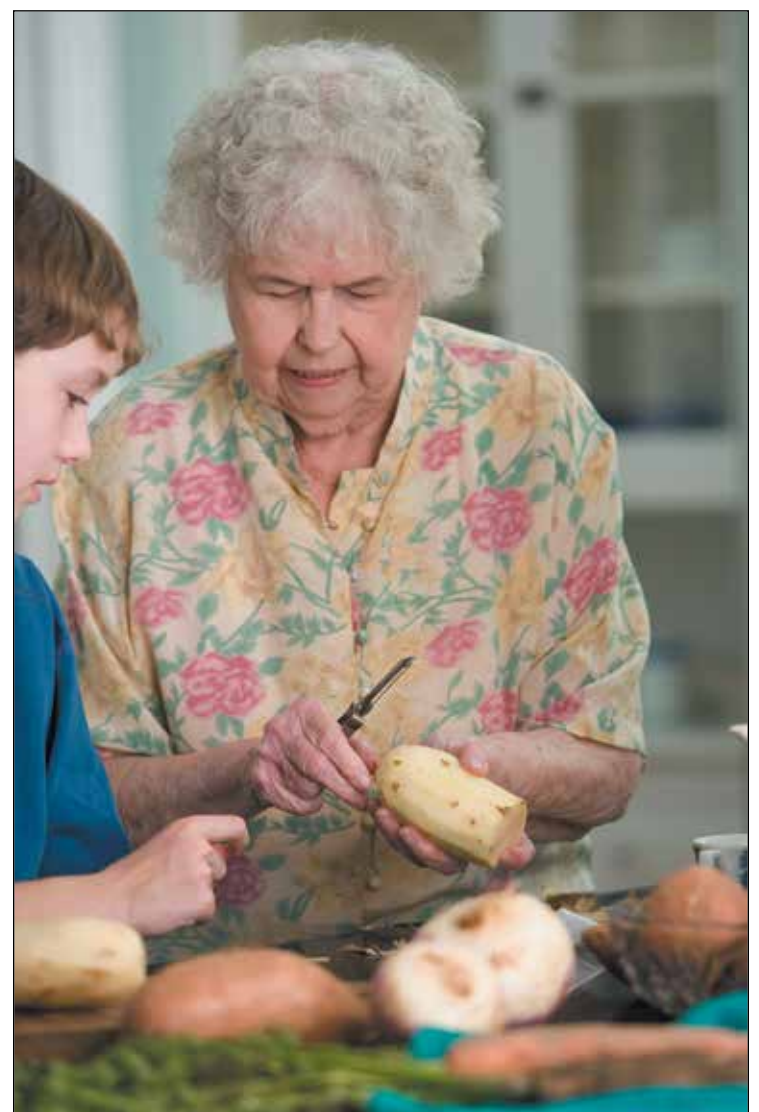
An increasing number of disabled seniors could disrupt America's healthcare system.

"Before my mom died in October 2019, she became blind from macular degeneration and deaf from hereditary hearing loss. But she would never say