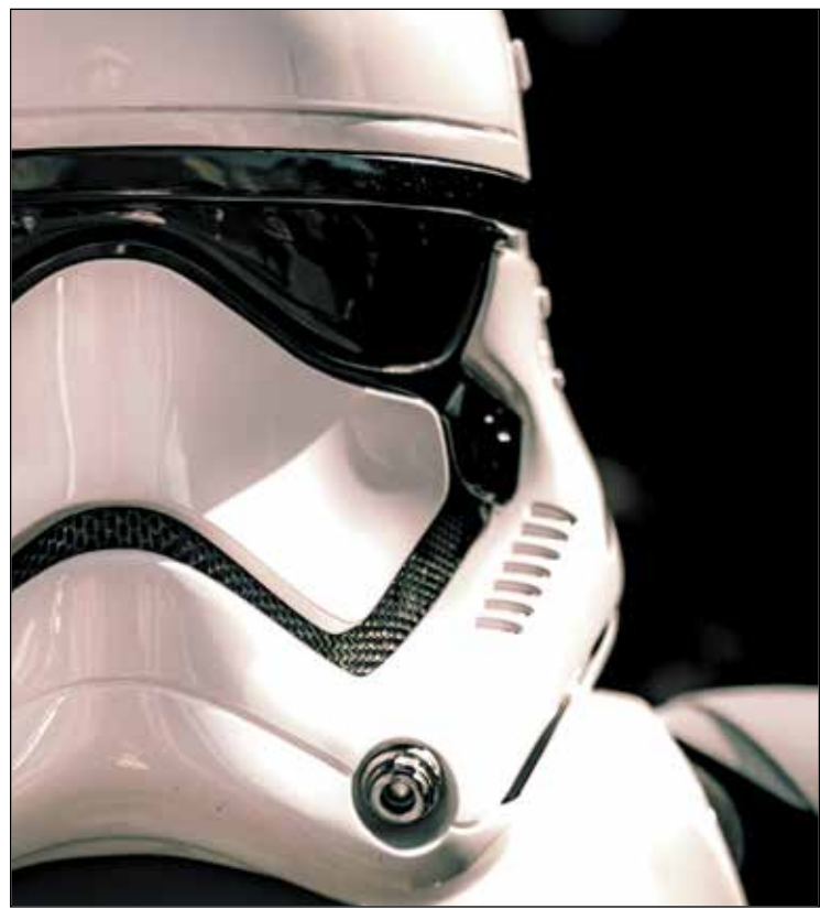
Disney's popular Star Wars themed "Season of the Force" will make its return next year.