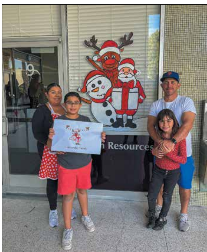
Local children helped decorate Norwalk City Hall last weekend, making the facility ready for Christmas.

Singer and actress BETTE MIDLER (78), comedian SARAH SILVERMAN (53), and "X-Men" star ZOË KRAVITZ (35).