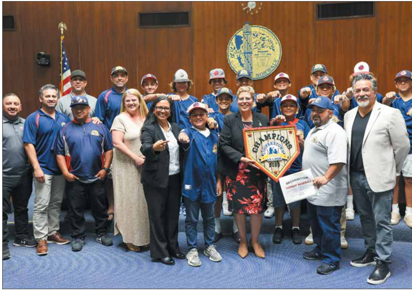
Combat Baseball's 13 and under team was honored by the Norwalk City Council on Tuesday for winning the 13U Wood Bat Cooperstown All-Star Village championship.