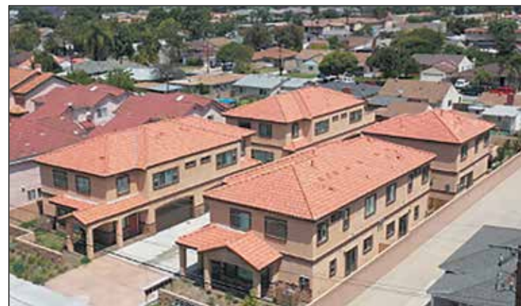
With funding, Cerritos College says it is ready to build affordable housing for over 400 students. The Village is pictured above.

Cerritos College is currently seeking state grant funding to