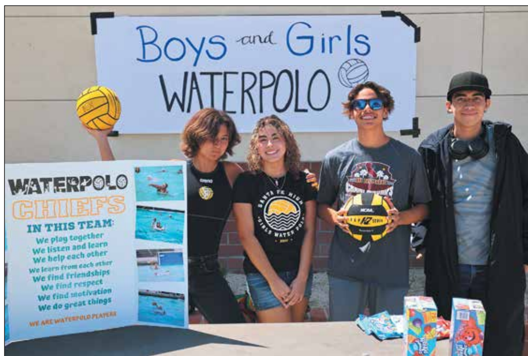
Santa Fe High School's water polo team kicks off the 2023-24 school year during Santa Fe's Freshmen First Day Club Rush event on Aug. 15.

The 2023-24 school year also welcomed new policies that aim to boost student wellness and inclusion. The Board approved a Land Use Acknowledgement policy and an Alcohol and Other Drugs policy during the June 13