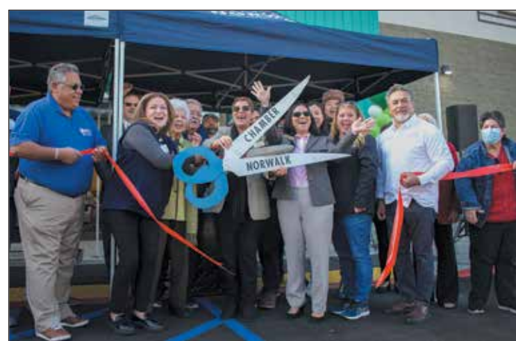
Members of City Council and the Norwalk Chamber of Commerce celebrate the opening of Sprouts with a ribbon cutting

■ Sprouts Farmers Market opened to hundreds of shoppers eager to take advantage of special discounts during opening weekend.