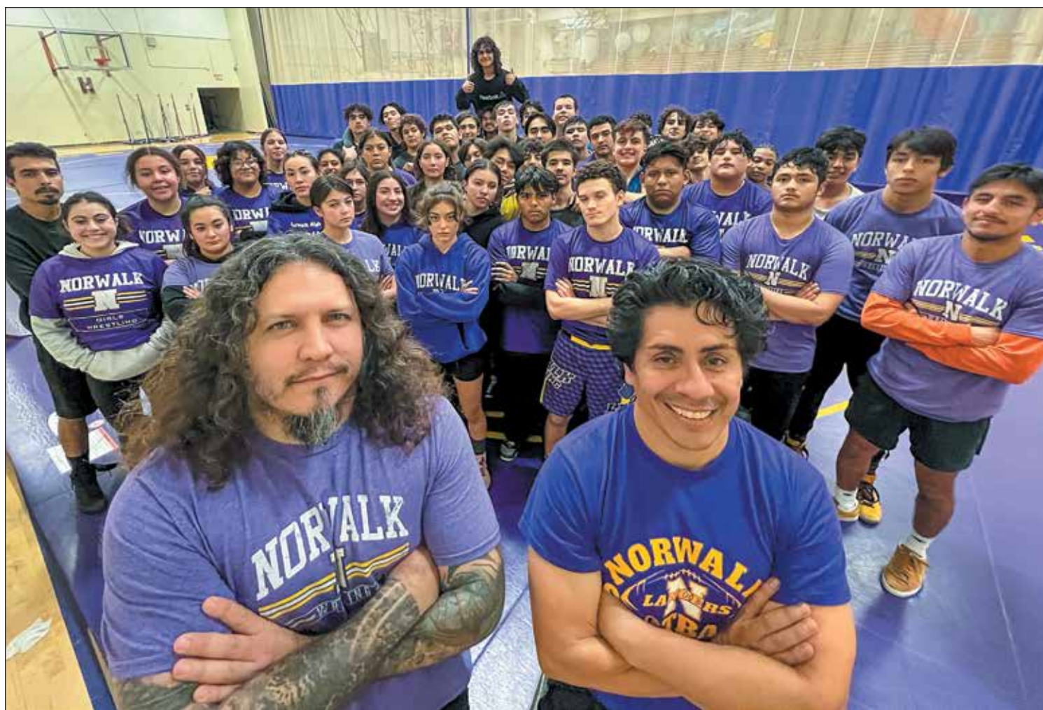
Norwalk High School's boys and girls wrestling teams hope last year's success carries over into the new season.

“This is a sign that Norwalk is a school focused on Girls Wrestling as a team and not just ‘we have girls on the team’, as other schools sometimes look at things,” added DeVries. “As a program, we look forward to growing the sport and continue to create a solid program that produces solid individuals ready for whatever comes their way on the wrestling mat or in life.”