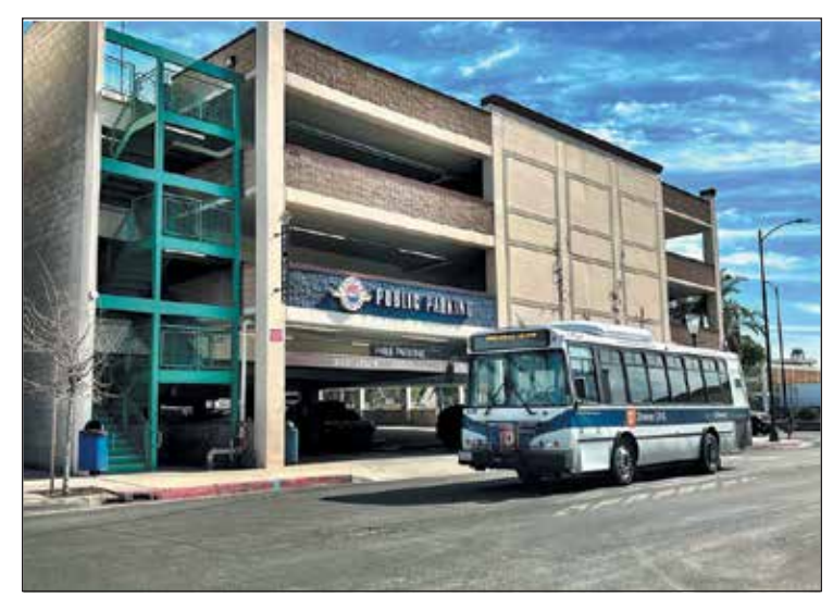
Council members are considering eliminating the Downey Link, citing declining ridership.