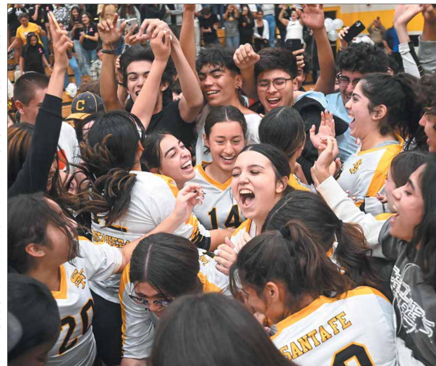
Santa Fe players and students celebrate their win over Trinity Classical Academy after their CIF quarterfinal playoff match at Santa Fe High School on Wednesday. Santa Fe defeated Trinity Classical Academy 3-1.

said. would have been very disappointed if I did.'