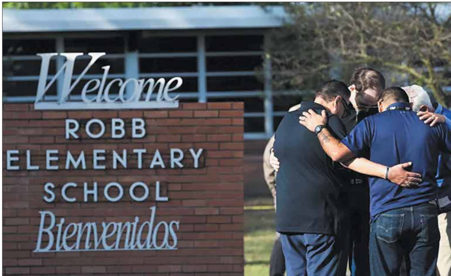
People gather at Robb Elementary School, the scene of a mass shooting in Uvalde, Texas, on Tuesday.

Downey Police also maintains emergency response plans for each school campus, including contingency plans for evacuations.