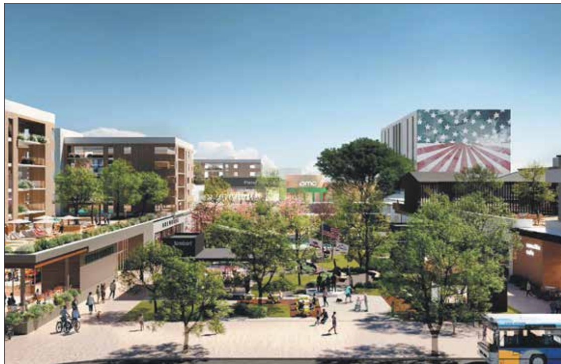
A rendering of Norwalk's proposed civic center redevelopment.