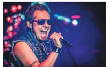
Elton John's Classic Hits Saturday, Cerritos Center