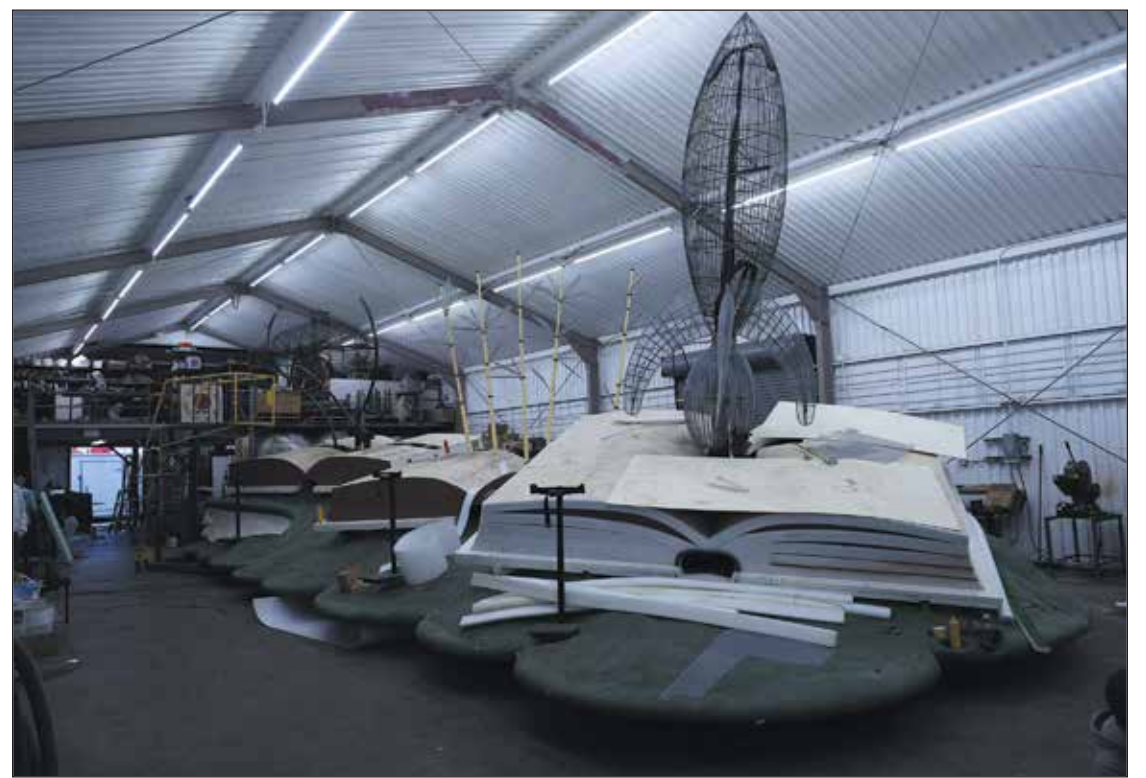
Volunteers spent this week preparing Downey's float for the Tournament of Roses Parade on New Year's Day.

"I had no idea I was going to submit an entry at first; I didn't even know we were going to the meeting before that night," said