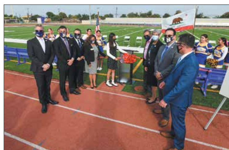
The Grand Opening Ceremony of the Norwalk Athletic Fields and Stadium at Norwalk High School in October.

Actor and director Anthony Hopkins (84), "Iron Man" actor Ben Kingsley (78), "Batman Forever" star Val Kilmer (62), New Kids on the Block member Joey McIntyre (49), pop singer Psy (44), and gymnast Gabby Douglas (26).