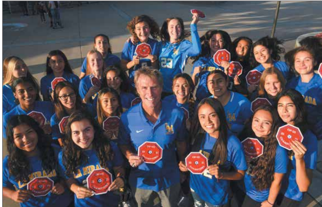
La Mirada Varsity Girls Soccer team with the CIF Division 2 Championship letters at the La Mirada City Council meeting.