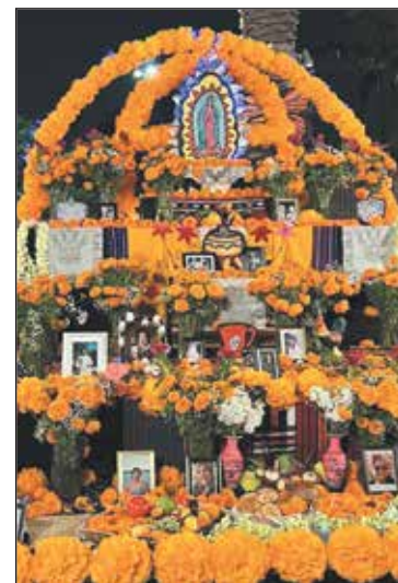
The community altar at Downey's Dia de los Muertos Festival

Back at the Embassy Suites side of the Theatre Plaza, families gravitated for picture-taking to a trio of giant caterinas made of