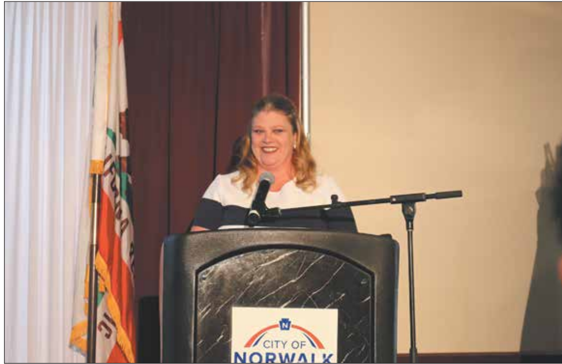
Norwalk Mayor Jennifer Perez delivers the State of the City address to Norwalk officials on Oct. 22. The address included updates on the city's effort to reduce crime, help businesses and manage the COVID-19 pandemic.

She continued to say that grants and funding can assist businesses in need, most notably the American Rescue Plan.