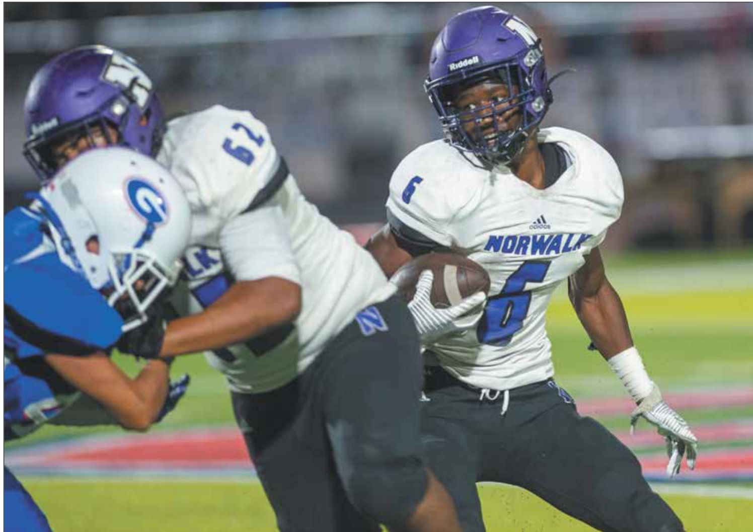
Norwalk scored three touchdowns in the first quarter on their way to a 51-7 win over John Glenn last Friday.