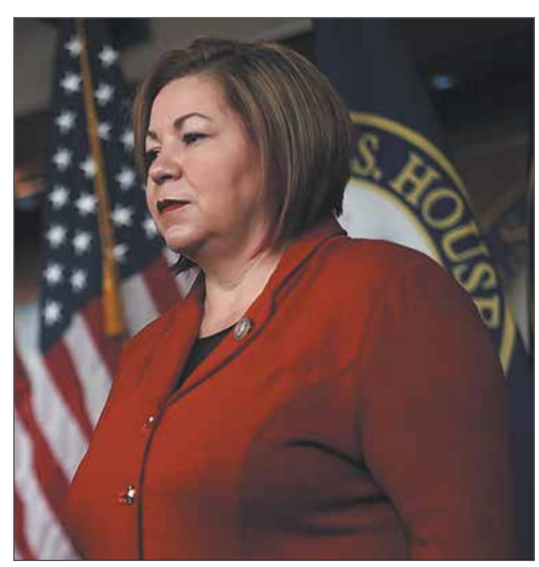
Rep. Linda Sancherz joined other House leaders in calling for immigration reform to be included in budget proposals.