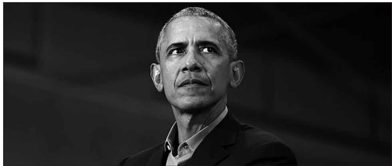
President Obama's new book is a reminder that he needlessly expanded the war in Afghanistan.

He understood the scale of the task in Afghanistan. "We needed to drastically improve the (President Hamid) Karzai government's ability to govern and provide basic services," Obama recalls. "We needed to train up the Afghan army and police force so that they would be competent and large enough to maintain security within the country's borders without help from U.S. forces." And unless