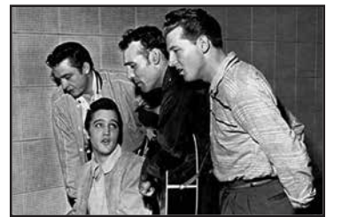
Million Dollar Quartet

The Million Dollar Quartet, comprised of Elvis Presley, Johnny Cash, Jerry Lee Lewis and Carl Perkins, recorded nearly two dozen songs together for the first and last time.