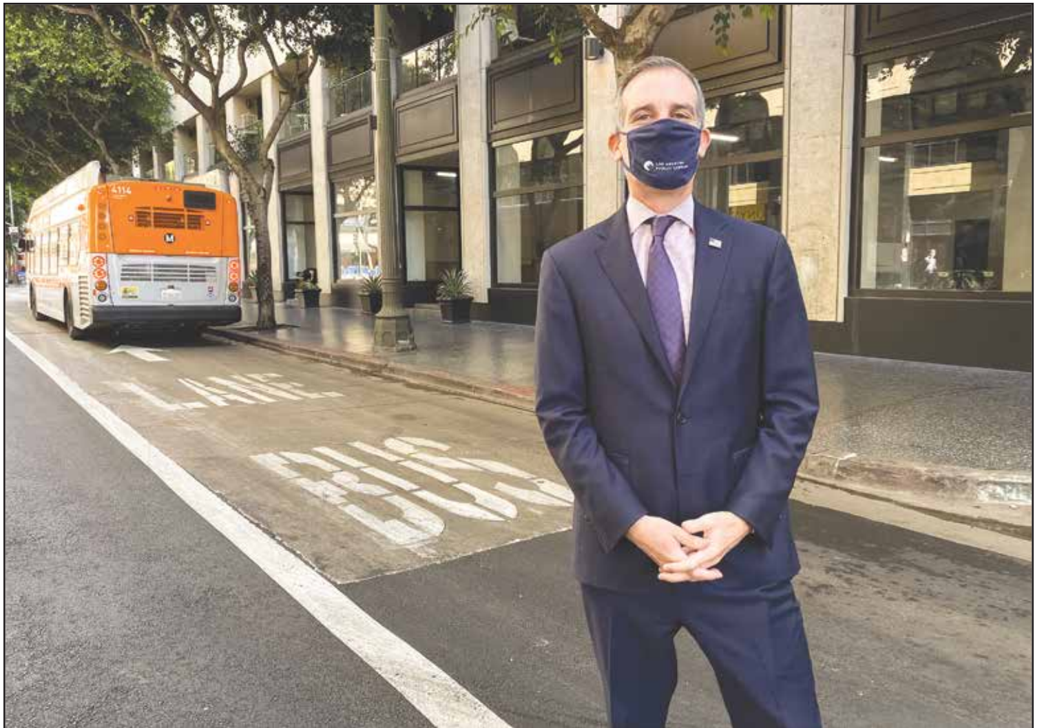
It will take years for Southern California to recover financially from the coronavirus pandemic, according to a consortium of government officials. Los Angeles Mayor Eric Garcetti is pictured.

In Orange County, the hardest hit sector was Leisure and Hospitality, which saw considerable losses as restaurants, hotels, and of important note – Disneyland – shut their doors for the first extended period since opening in 1955. Despite these losses, Orange County's diversified industry base has already made progress in