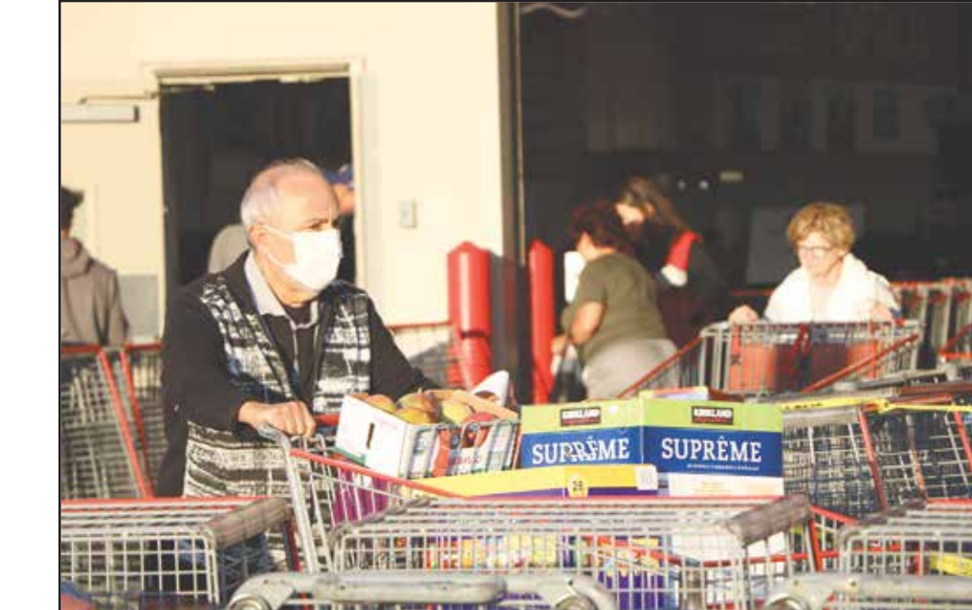
A shopper - wearing a medical mask - exits Costco.