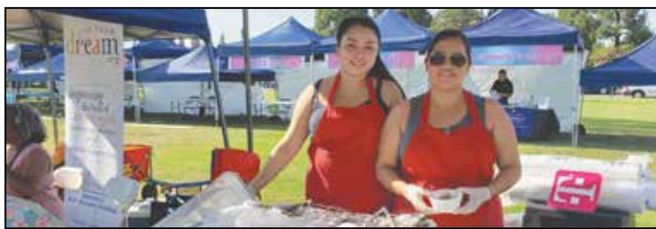
New Norwalk Chamber Member, Toros Taqueria, provides samples of their catering items at the Expo. Visit them at 15617 Studebaker Rd. to try some delicious treats.