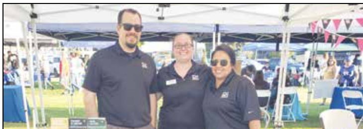
Sponsor Farmers & Merchants Bank at the Annual Business Expo. Norwalk Chamber President is pictured here with other staff.