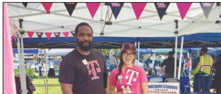
Silver Sponsor T-Mobile at their Expo Booth.