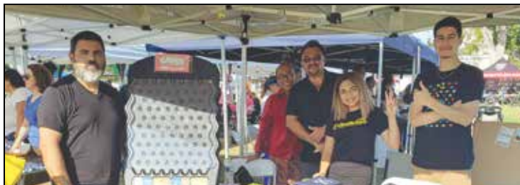
Staff of El Clasificado/EC Hispanic Media at the Annual Business Expo.