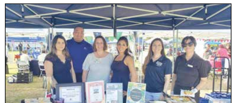
Sponsor DoubleTree by Hilton, Norwalk Los Angeles, providing lots of treats for attendees at the Business Expo.