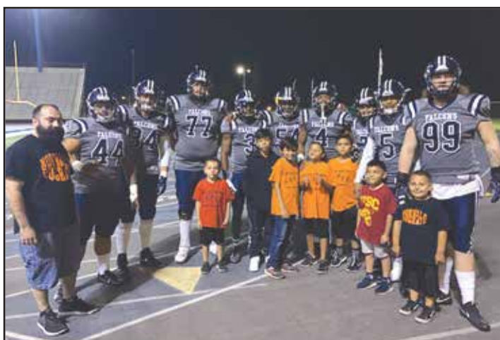
The Norwalk Rugrats attended Saturday night’s Cerritos College football game, which they attended as guests of the Falcons.