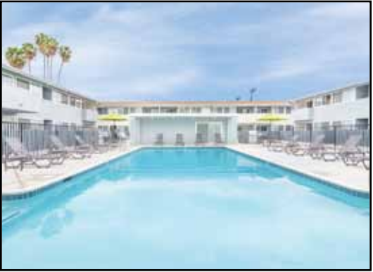
Rental prices in Norwalk continue to climb, according to analysis released this week.