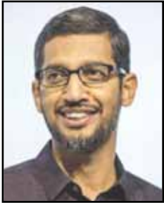
Google CEO Sundar Pichai

This is how Google has gotten away with unauthorized scanning and indexing of student email accounts and targeted online advertising based on search engine activity, as well as auto-syncing of passwords, browsing history and other private data across devices and accounts belonging to students and families unaware of default