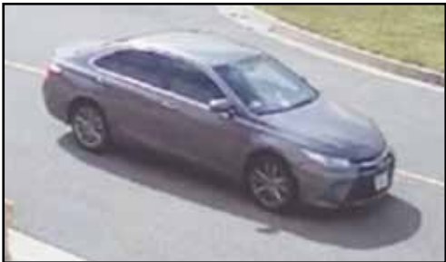
This is the silver Toyota Camry that struck and killed Maria Chavarria last month.

The car being sought is described as a dark gray, four-door, 2015-2017 Toyota Camry. It