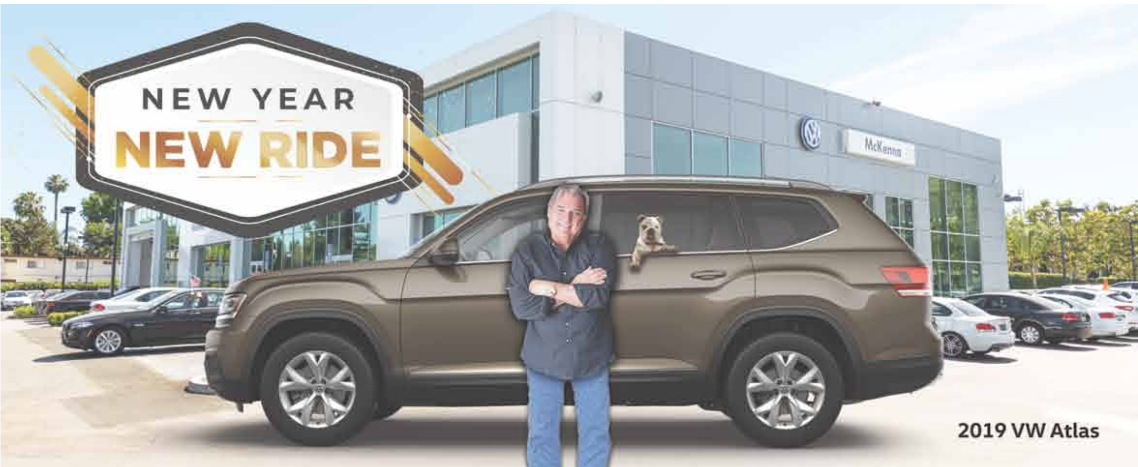
2019 VW Atlas