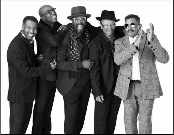
The Temptations are performing at the Cerritos Center for the Performing Arts on Friday night.

With her trademark “cuchi cuchi,” Charo shook up the world, becoming an international sensation with her Flamenco-inspired Platinum album “Guitar Passion.” The guitarist-singer-comedienne comes to the CCPA, joined by acclaimed TV personality and Broadway veteran John Davidson, who is best known for playing Curly in “Oklahoma!,” a role that won him the Theater Guild Award. Catch these two on Sunday, January 27 at 2 p.m. Tickets start at $50.