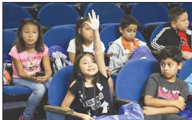
D.D. Johnston Elementary students toured Norwalk City Hall recently, receiving a behind the scenes look at city government.