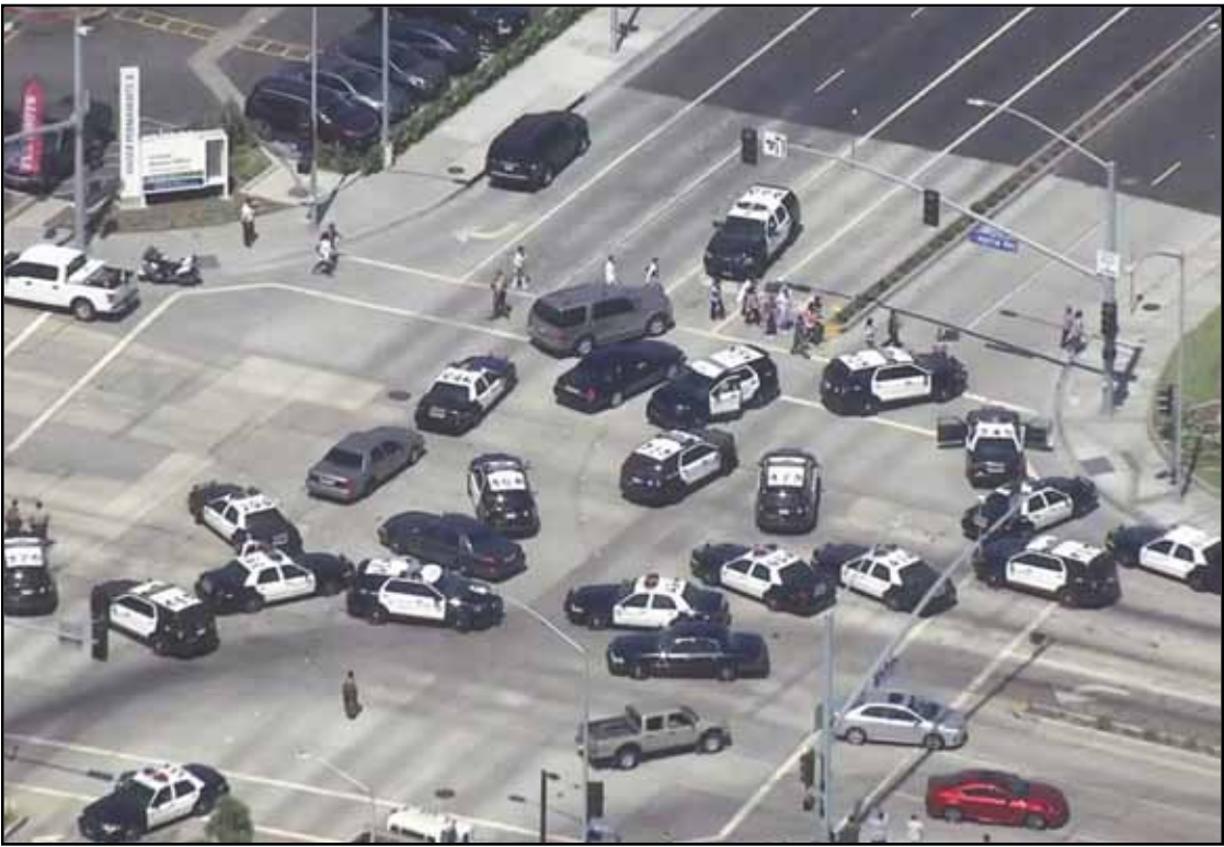
Dozens of police officers swarmed Kaiser Permanente hospital in Downey on Tuesday after receiving reports of a possible active shooter. It was later determined that no shots were fired.