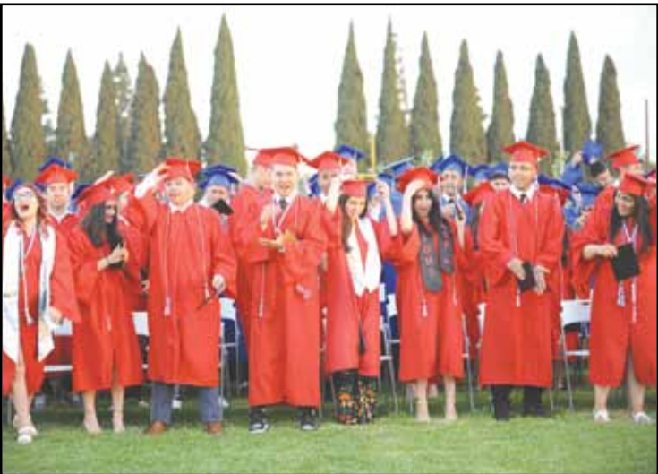
Seniors celebrate at the John Glenn High School graduation ceremony in June.

All the NLMUSD campuses — 17 elementary schools, six middle schools and five high schools — are part of the district’s technology