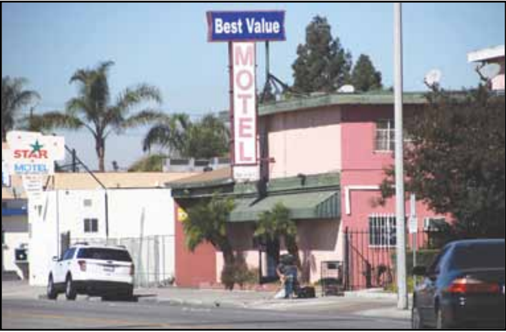
A homeless man collects recyclables outside a Norwalk motel.

last November’s community forum held at Dolland Elementary School, ironically just a couple blocks south of the CYA property.