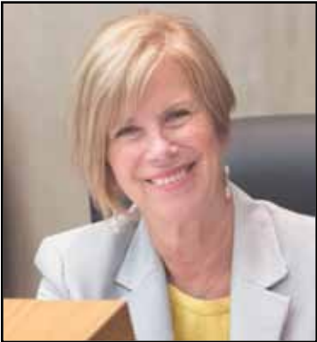
L.A. County Supervisor Janice Hahn

To view the complete proposed homeless plan for Norwalk, visit the Norwalk website at norwalk.org and select agendas in the search and press “Special Council meeting,” April 10.