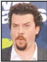
Danny McBride actor 41