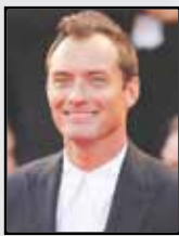
Jude Law actor 45