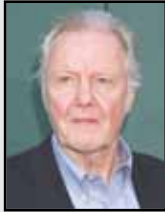
Jon Voight actor 79