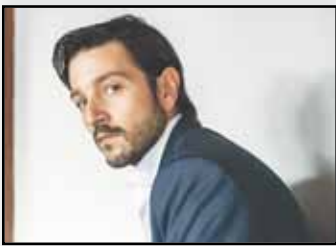
Diego Luna, the acclaimed Mexican actor, turns 38