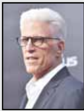
Ted Danson actor 70