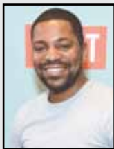
Mekhi Phifer actor 43