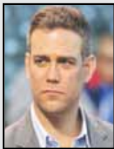
Theo Epstein baseball executive 44