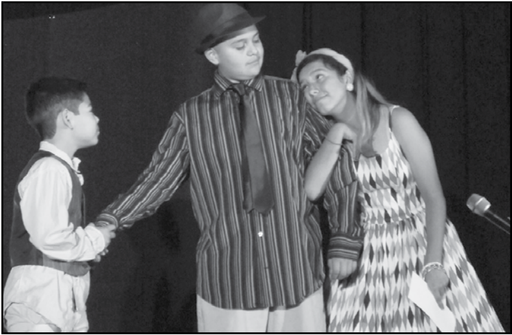
Through the BRIDGE Theatre Project, Lynwood Unified students will perform their own original works at their schools throughout the year.