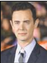
Colin Hanks actor 40