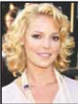
Katherine Heigl actress 39