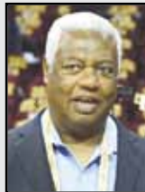
Oscar Robertson basketball player 79