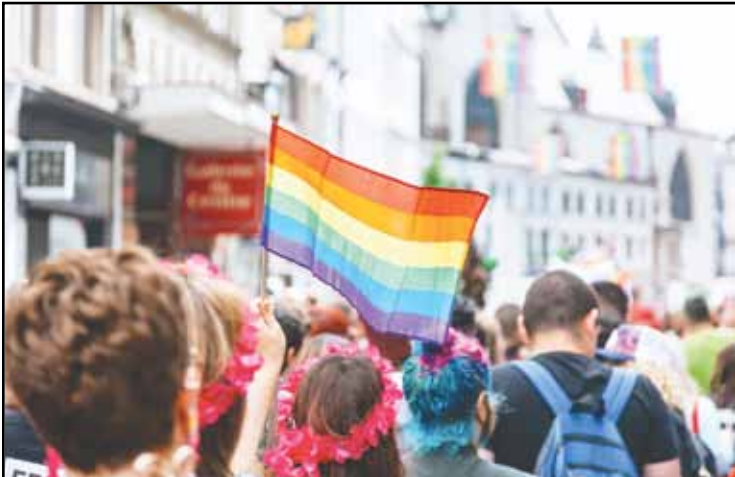
Hate crimes, particularly those targeting gays and lesbians, are on the rise in L.A. County.

"The fact that white supremacist crimes grew 67% is alarming, particularly in the aftermath of the "Unite the Right" rally in