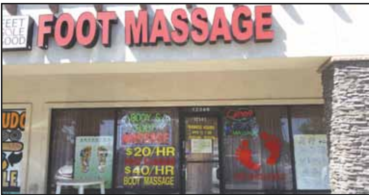
Supervisors voted Tuesday to require massage parlors to undergo periodic inspections.

"Ninety percent to 95 percent of the time that we perform an undercover investigative operation