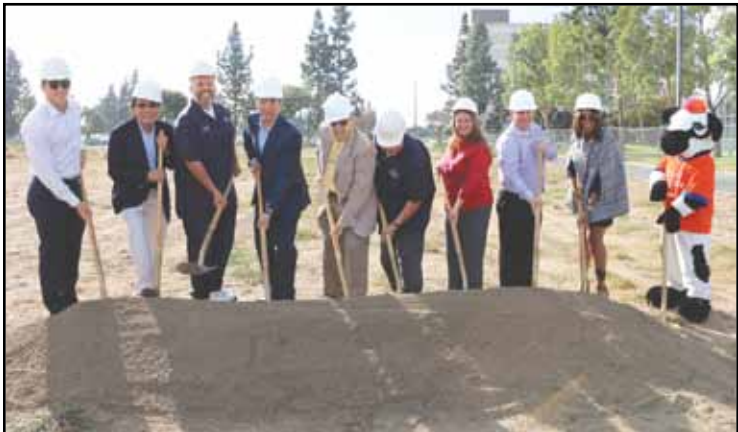
Officials break ground on the new Fitness Village at Bloomfield Avenue and Imperial Highway.

According to a report made by QSR, Chick-fil-A generated over $7.9 billion in revenue in 2016, averaging about $4.4 million per unit throughout 2,102 total stores.