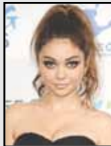
Sarah Hyland actress 27