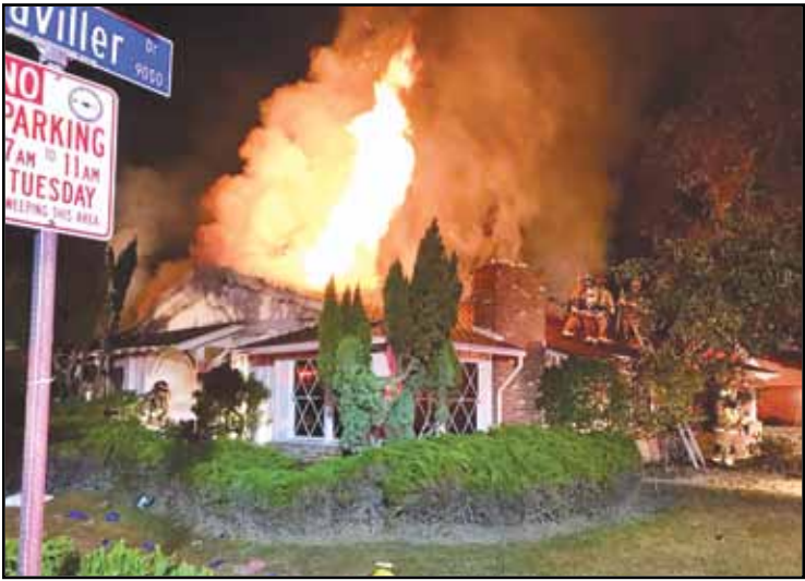
A house fire killed two residents early Saturday morning.