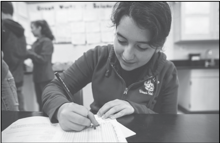
Odyssey STEM Academy will begin with a freshman class in 2018-19 and add a grade level each year until achieving full enrollment at 600 students.

The District plans to create a bridge from its middle school’s PLTW curriculum, which offers a broad scope of STEM learning, to its pathway offerings at Paramount High School and Odyssey. Paramount High School offers computer-integrated manufacturing as an engineering