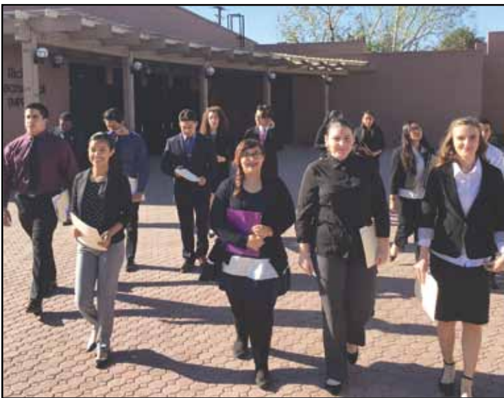
The Norwalk Education Alliance helped earn the Norwalk-La Mirada Unified School District a Golden Bell Award.

For more information about the Alliance and its purpose, visit the Norwalk-La Mirada Unified School District's special webpage at nlmusd.org.